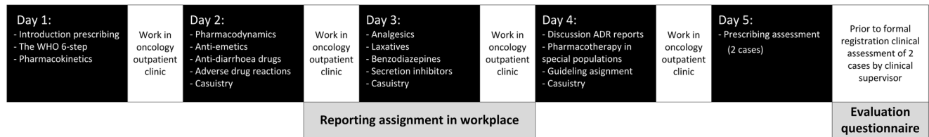
Fig. 1 Overview of the first course on prescribing at the Amstel Academy (VU University Medical Center) for specialist oncology nurses between November 2015 and May 2016. The nurses follow the course in addition to their work in different (most non-academic) hospitals in the Netherlands which is depicted in the white boxes. The course consists of 4 days (6 h/day) equally spread over half a year, which

is depicted as black boxes. Within these boxes, the discussed themes are noted. The nurses were instructed regarding the reporting assignment during a lecture in day 2 (January). This lecture included a general lecture on pharmacovigilance in the Netherlands. The ADRs had to be reported before the group discussion (day 4, in March). Following the last day of the module, the evaluation survey was distributed