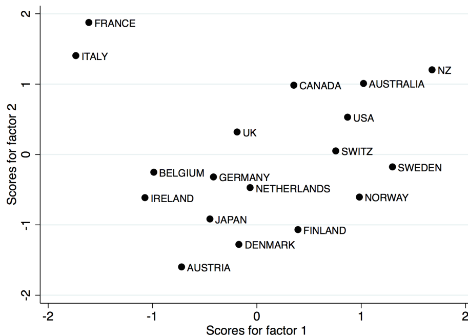
Figure 2: Country factor score plot: Exploratory factor analysis of aggregate national measures of political behavior and related measures (e.g. trust, political interest).

the highest levels of membership in voluntary associations also have some of the lowest ratios of active participation (e.g., Sweden and Norway — see Wollebaek and Selle 2003:83). Even in liberal countries, scholars have noticed the sharp rise of “paper membership organizations” (Skocpol 2003) during the twentieth century.