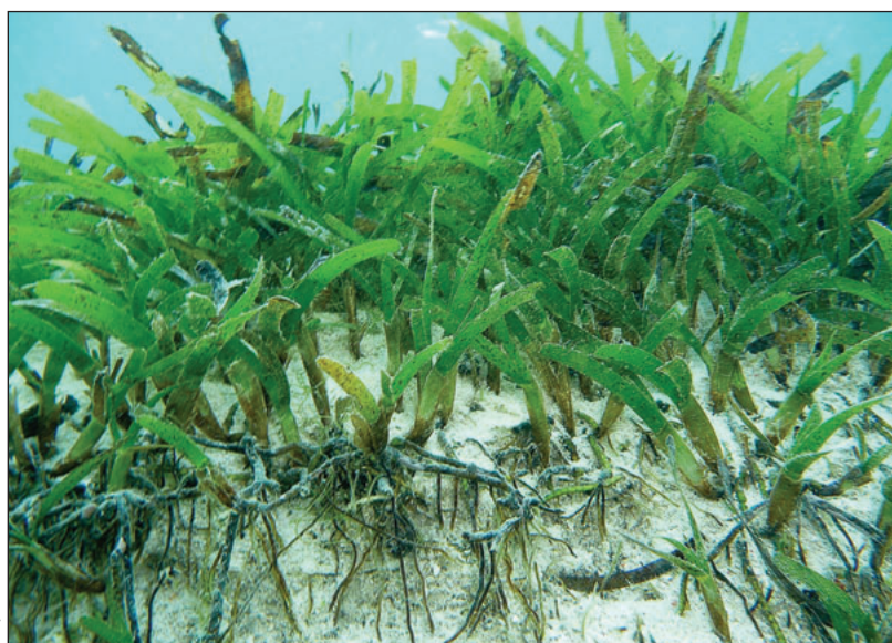
Figure 3. Shallow seagrass meadow ( Cymodocea serrulata ) in Zanzibar, Tanzania. Roots and rhizomes trap and store sediments and associated organic carbon.

Unlike terrestrial soils, the sediments in which healthy