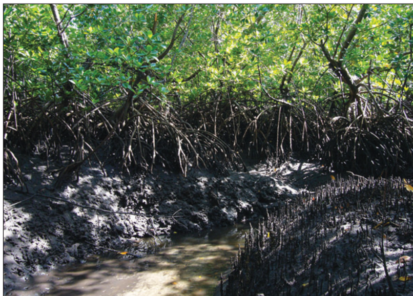
Figure 2. Mangrove forest ( Rhizophora mucronata in the background; pneumatophores of Avicennia marina in the foreground) in Gazi, Kenya. Complex root systems slow down tidal waters and trap carbon-rich particles from the water column and store them in sediment.

remain as atmospheric CO 2 and exacerbate climate change (Chmura et al. 2003; Duarte et al. 2005a; Bouillon et al. 2008; Laffoley and Grimsditch 2009; Nellemann et al. 2009; Duarte et al. 2010; Kennedy et al. 2010). These ecosystems sequester C within their underlying sediments, within living biomass aboveground (leaves, stems, branches) and belowground (roots), and within non-living biomass (eg litter and dead wood). Blue carbon is sequestered over the short term (decennial) in biomass and over longer (millennial) time scales in sediments (Duarte et al. 2005a; Lo Iacono et al. 2008).