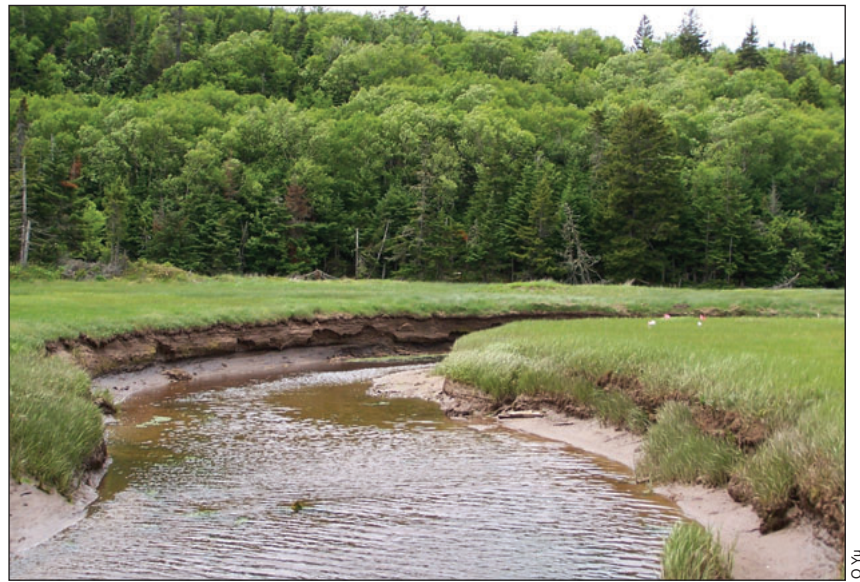
Figure 4. Salt marsh (Dipper Harbour Marsh) in the Bay of Fundy, New Brunswick, Canada. At low tide, greater than 2 m of marsh peat is clearly visible.

Although mangroves, seagrass meadows, and salt marshes represent a much smaller area than terrestrial