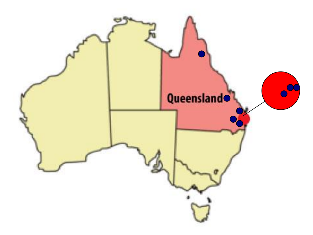
Figure 1. Locations of the 8 Centres (3 in Brisbane itself).

Eight O&EECs in Queensland, Australia agreed to participate in the research. These included Centres from Brisbane (3), South-East Queensland (3) and northern coastal (2) locations (see Figure 1). The aim of these centres is to "promote, develop, provide and deliver highly effective outdoor and environmental education programs for schools and the community, and provide professional development for teachers" (Queensland Department of Education, Training and the Arts 2003).