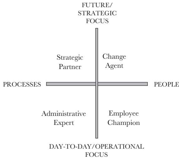
Figure 2. Ulrich: four roles of HR professionals

emergence of new HR roles. It is an inspiring and sometimes disconcerting vision: HR professionals must become champions of competitiveness in 'delivering value' or face the diminution or outsourcing of their role (Ulrich, 1997, p. 17).