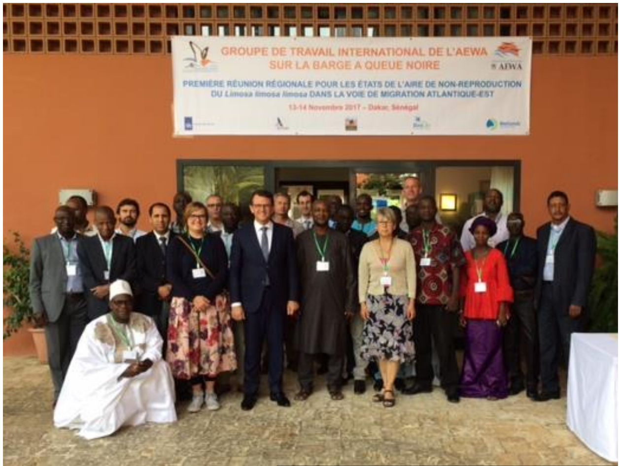
Delegates of the AEWA Black-tailed Godwit Workshop