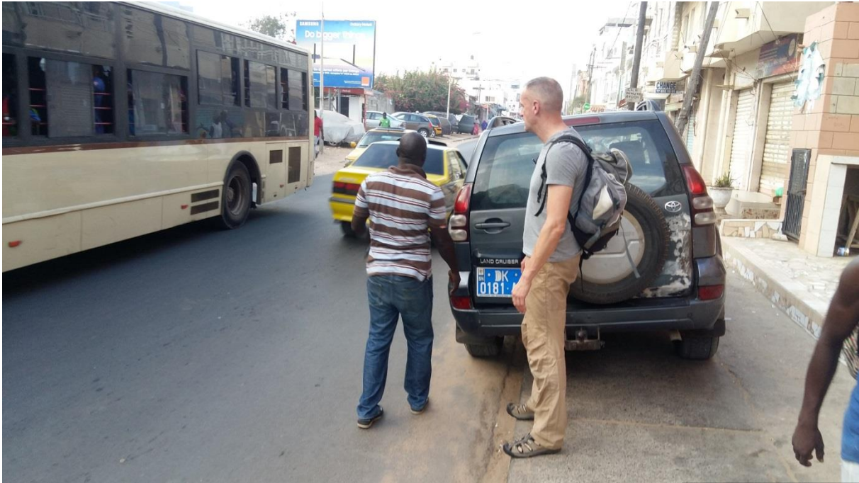
Arrival in Dakar