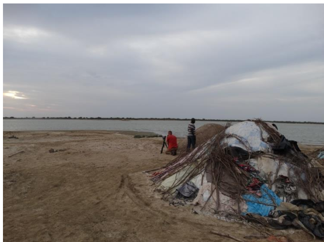
Cuvette de Ngaye-Ngaye

We met the new commander of the PN de Langue de Barbarie Col. Daha Kane and after exchanging information we went off to find Pope. In the early morning we soon found back the flock we saw the night before at the roost. They were resting and foraging in the Guembeul Reserve on both Chironomids (bird 1: 22; 2: 57; 3: 46; 4:45 prey items per 2 min.) and nodules (bird 1: 11; 2: 6; 3:8 nodules per 2 min.). With some patience it was possible to get really close to them and we managed to read 7 Dutch and 2 German ring combinations. All except 1 had been seen in West Africa before in the past 3 years.