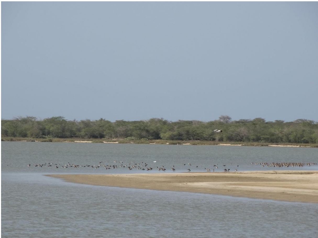
Réserve Naturelle de Guembeul