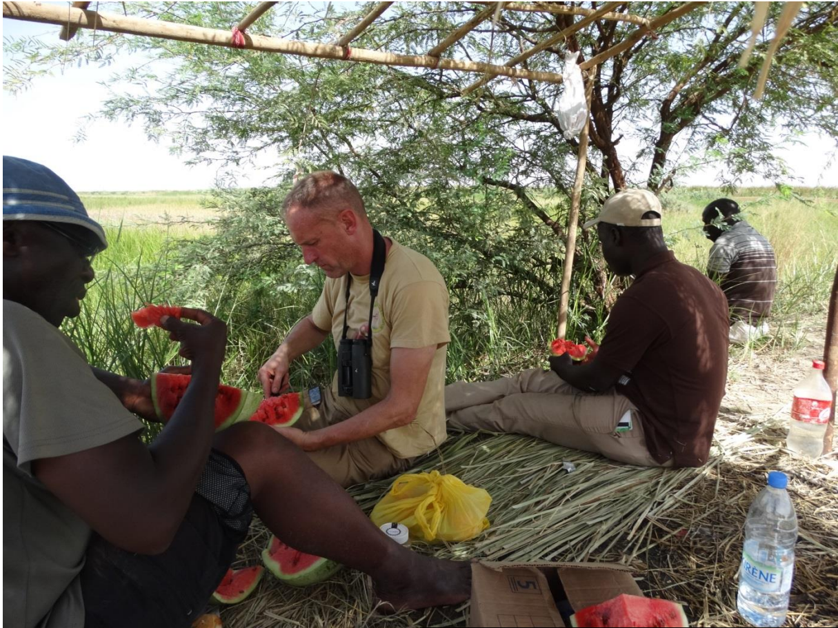
Lunch in the rice fields at Tocc-Tocc Reserve

We decided to go back in the late afternoon to see if birds would return to the wetland next to the Reserve and indeed between 17 and 19 pm about 750 birds. Some birds from very high suggesting they came from far to use this place as a night time roost. Two thirds of the birds were actively foraging on Chironomids (Bird 1: 15 preys per 2 min.; 2: 17; 3: 15; 4: 16) but much less successful than at sites we visited earlier. We closed the day with 15 ring combinations read; not bad at all after the deception of yesterday!