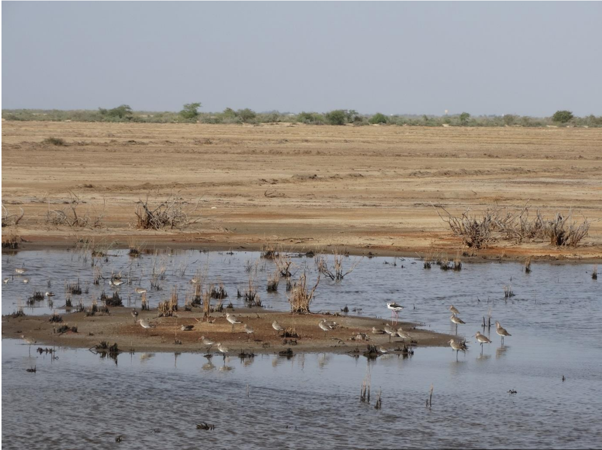
Mboubene Ricefields near St Louis