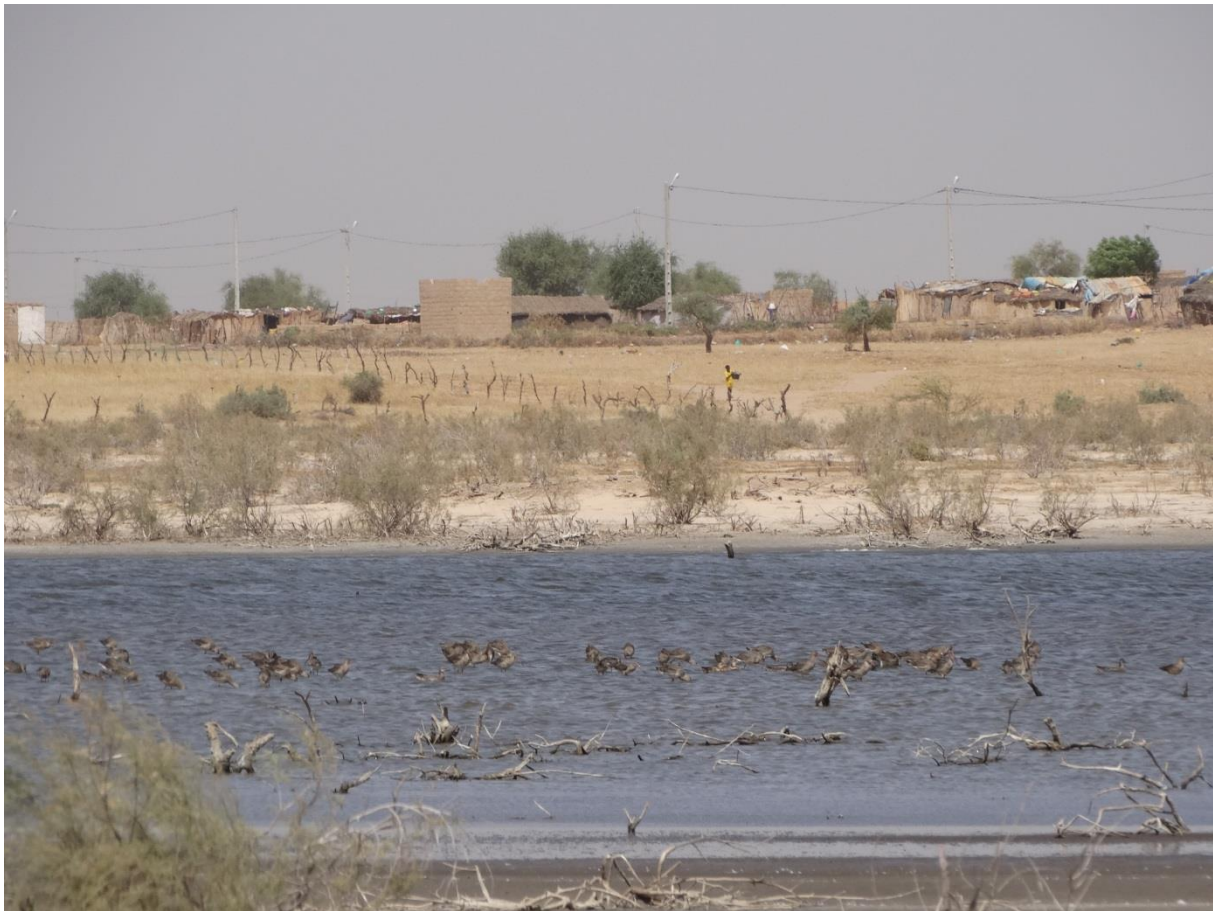
Nice flock at Marais Sapel

After a quick check of the mudflat at the Biological Centre (200 birds present but almost all in belly-deep water) and some Chironomid intake rate samples (Bird 1: 61 per 2 min.; 2: 31; 3: 53; 4: 74) we headed for the Tocc-Tocc Reserve near Rosso in the NW corner of Lac de Guiyeres. On the way we passed by the Mbwar Marshes and despite there was sufficient water, no godwits were present. We did not see any godwits in the ricefields either. Perhaps this has also to do with the enormous effort that is made to scare off Quelia finches that try to eat rice with flags, scarecrows, horns, yelling, drumming, gunshots etc. The parallel with the situation we have in The Netherlands with the increase of geese following the intensification of dairy farming grassland is striking! We picked up the conservator of the Reserve Ousseynou Niang in Ross Bethio and he would accompany us the entire day. In the ricefields around Tocc-Tocc we could not find any godwits but they were present in a basin that is used to drain the water from the ricefields before the harvest: Marais Sapel. We found