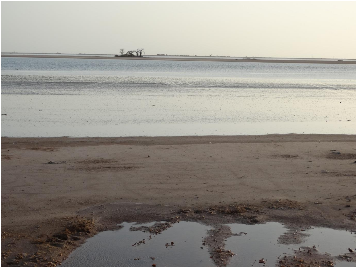
Floodplains near Palmarin, Ngalo

more flooded than in December 2016; this will probably mean that godwits will be more difficult to find because they have much more options to roost or forage. We spent the night at Palmarin.