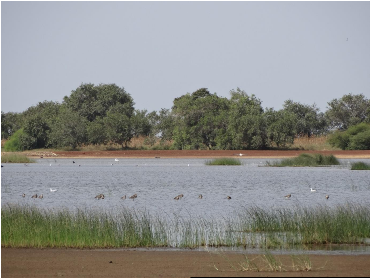
Floodplains of the Saloum river west of Fayil

from the direction of the Reserve. Most birds started to sleep immediately upon arrival but some foraged on Chironomids (1 bird: 44 preys swallowed in 2 min.). Hopefully we will manage to find more rings tomorrow morning when we will visit the reserve with conservator Pope Yamar Niang.