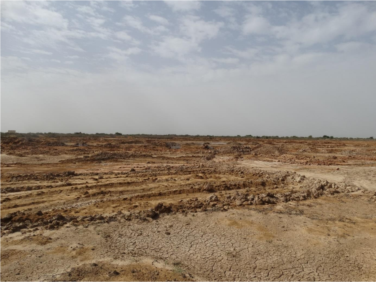
Destroyed wetland NW of Ross Bethio....funded by the EU

combinations before it became too dark. From a ring-reading perspective not a very good day but it was impressive and scary to see how fast agriculture is changing the appearance of the Senegal delta. We slept again at the Biological Centre.