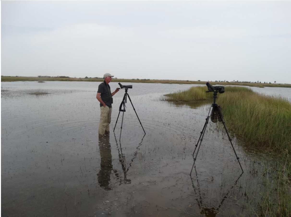
Floodplains of the Saloum river east of Diofior