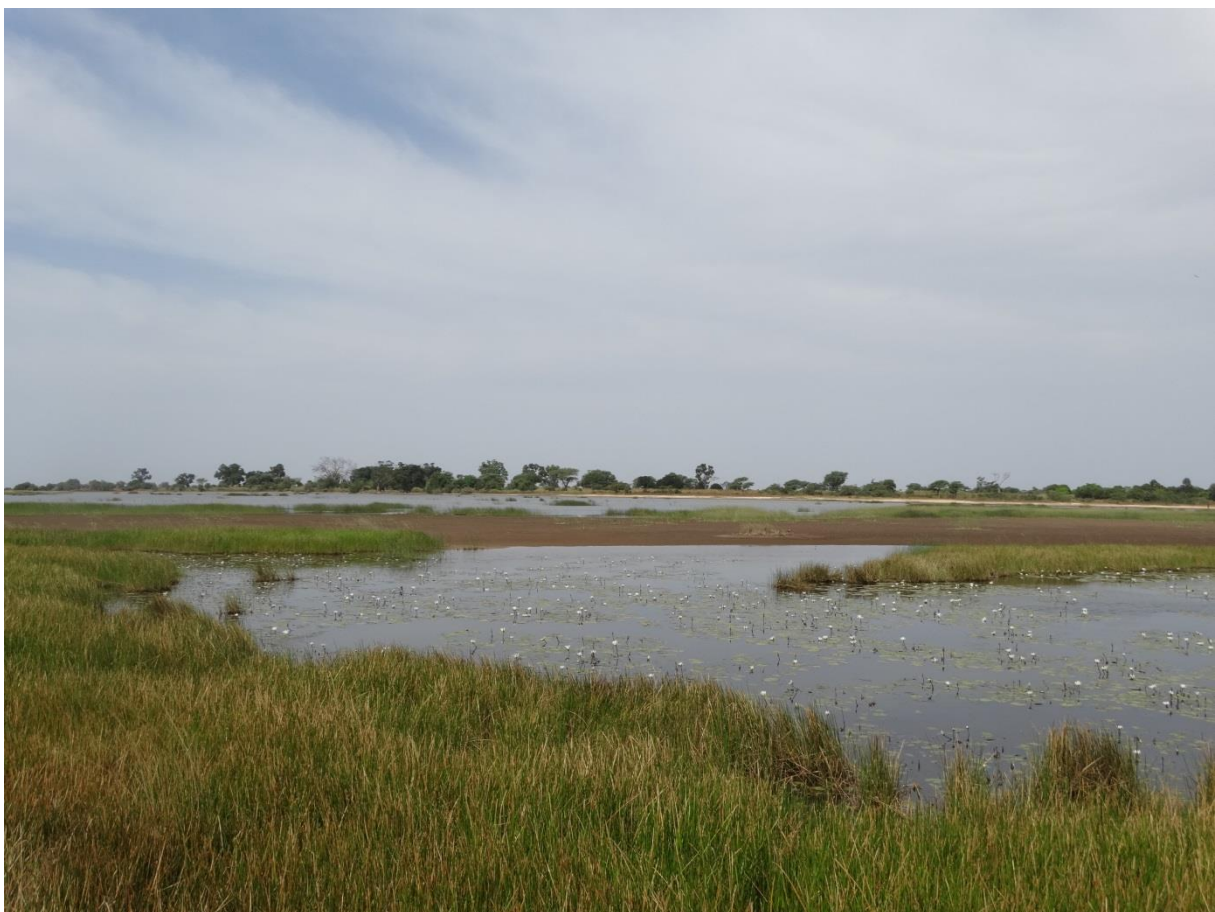
Floodplains of the Saloum river west of Fayil