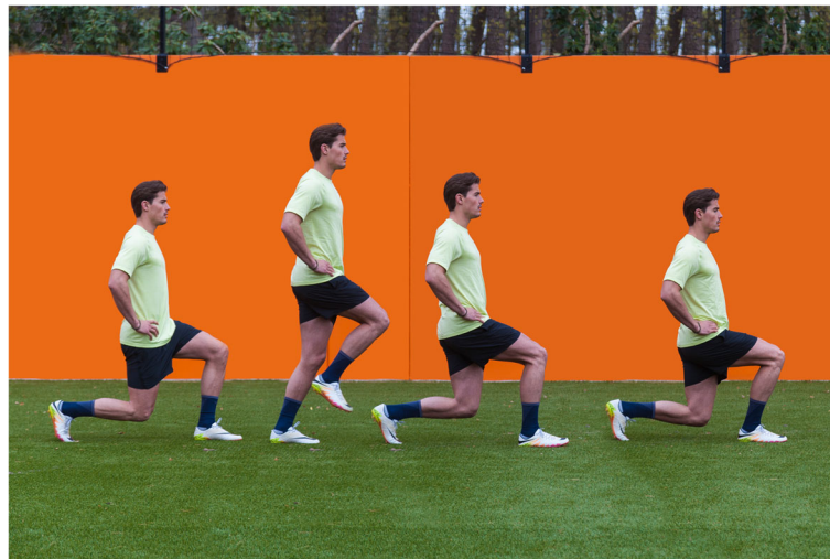
Fig. 1 Walking lunges

The research team is always accessible to answer questions by telephone or email. All participating teams are visited, and the medical staff has been asked to record the intervention on camera (cell phone) and to send the recording to the research team for analysis and feedback, at least every 3 weeks in the build-up phase. The BEP is performed at the end of the warming-up. Coaches and medical staff were advised to allow a short active recovery period before the rest of the training session if players complain of tired legs.