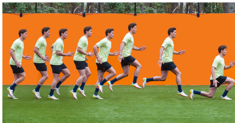
Fig. 2 Triplings followed by drop lunges

Injuries are divided into hamstring injuries, other injuries, and recurrent (hamstring) injuries. A hamstring injury is defined as any physical complaint affecting the posterior side of the upper leg resulting in an inability to play or train regardless of the need for medical attention