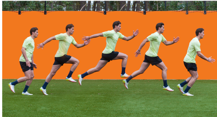
Fig. 3 Bounding

or time off soccer-associated activities [44]. In the case of a hamstring injury, both the player and the medical staff separately fill in a hamstring injury questionnaire to record epidemiology, severity, and aetiology of the injury. Other injuries are defined as any physical complaint, other than affecting the posterior side of the upper leg, that results in an inability to play or train regardless of the need for medical attention or time off soccer-associated activities [44]. Other injuries are recorded for measuring exposure and are not further specified by an injury follow-up questionnaire. Recurrent injuries are defined as an injury of the same type and at the same site as an index injury occurring after a player has returned to full play/training. In the case of a recurrent hamstring injury, the player and medical staff will receive the same hamstring injury questionnaire as for the primary hamstring injury.