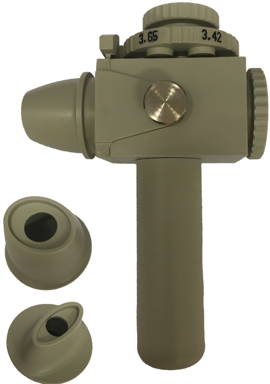
Fig 1. The test inhaler used in this study with the oval (top) and oblong mouthpiece design. The test inhaler is equipped with a differential pressure gauge through the bottom of the handle and connected to a data acquisition system for recording of the inspiratory flow manoeuvres. The rotatable ring with orifices of different sizes on top is used to set the airflow resistance. The test inhaler has been described previously in more detail [7].

https://doi.org/10.1371/journal.pone.0183130.g001