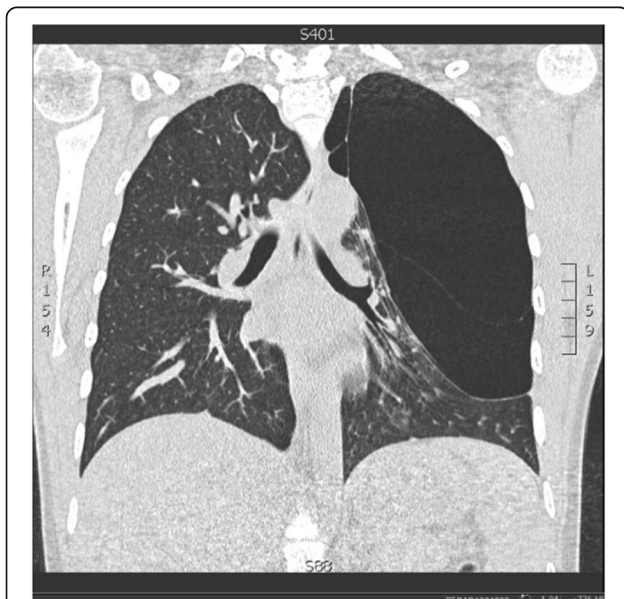
Fig. 1 Pre-operative high resolution CT scan, showing the massive bulla (17 × 12 cm) of the left upper lobe with compression of the remaining lung parenchyma

Our patient had an uneventful postoperative course. The chest tube was removed on the second postoperative day. On the third day after surgery she was discharged in good clinical condition. Routine chest X-Ray before discharge showed a small persistent pneumothorax due to the inability of the left lower lobe to fill up the entire left chest. On follow-up two and a half months later the patient was in good clinical condition with a remarkable decrease of dyspnea sensation. The chest X-Ray showed