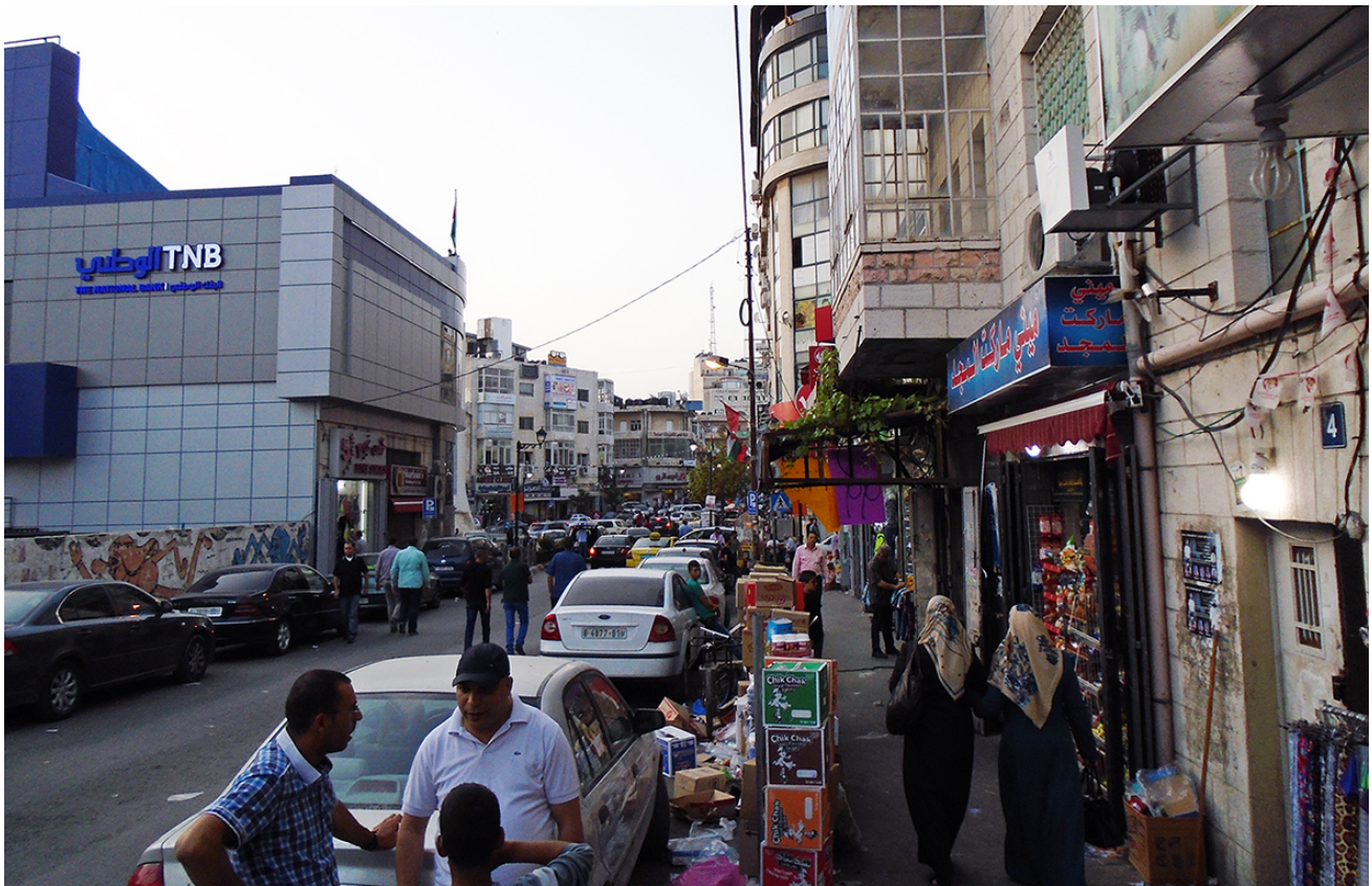
Figure 2. Area A delineates the major pre-existing Palestinian urban agglomerations, such as Ramallah, and is under full Palestinian jurisdiction and civil control.

(additional 628,000 Israeli settlers) since outline plans, the provision with technical infrastructure (e.g. roads, water), issuing of building permits (including refurbishment or upgrading) are executed and controlled by the Israeli administration. Different authors and various UN agencies are reporting on the arbitrary, ambiguous decisions in issuing such permits. OCHA (OCHA oPt, 2015a, 2015b) reports that between 2010 and 2014 only 1.5% of submitted applications were approved. More recently Hague (Hague, 2016) reported that although local zoning and outline plans match the international technical standards, only three of them were approved and the rest denied based on the alleged technical deficiency. As a result, informal building activities are taking place, additionally enhanced by the artificial land scarcity and arbitrary practices (see also Hague, Crookston, Wegener, Platt, & Gladki, 2016).