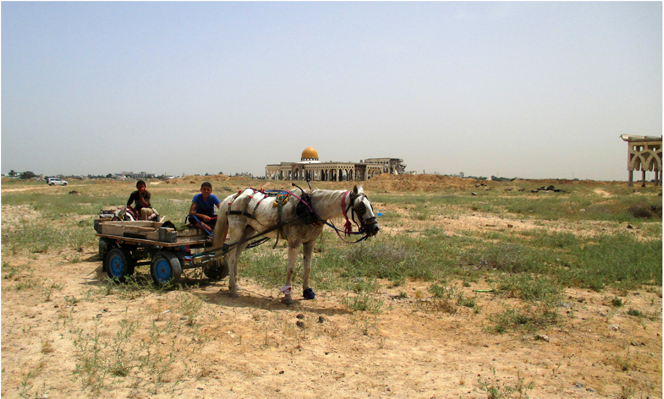
Figure 7. Destroyed Yasser Arafat International Airport at the southern border in the Gaza Strip.

ing opportunities, restricted mobility options, separation walls, containment into a certain area, road blocks, informal housing, demolition of houses and the destruction of spatial structures all indicate the spatial dimension of power and control in the West Bank and in the Gaza Strip (Yiftachel, 1998). As for the institutional dimension of power, we can see that with the lack of land-titles, the institutional framework for Area C is inhibiting Palestinian authorities from implementing plans and policies and creating a statutory relationship between the authorities and citizens (Forester, 1993). The lack of planning authority in Area C restricts all spatial initiatives and development plans and also exacerbates the mobility developments that are actually envisaged. Further, it prevents spatial practices of individuals, by rejecting individual applications for building permits. An interview partner commented on this power dimension: