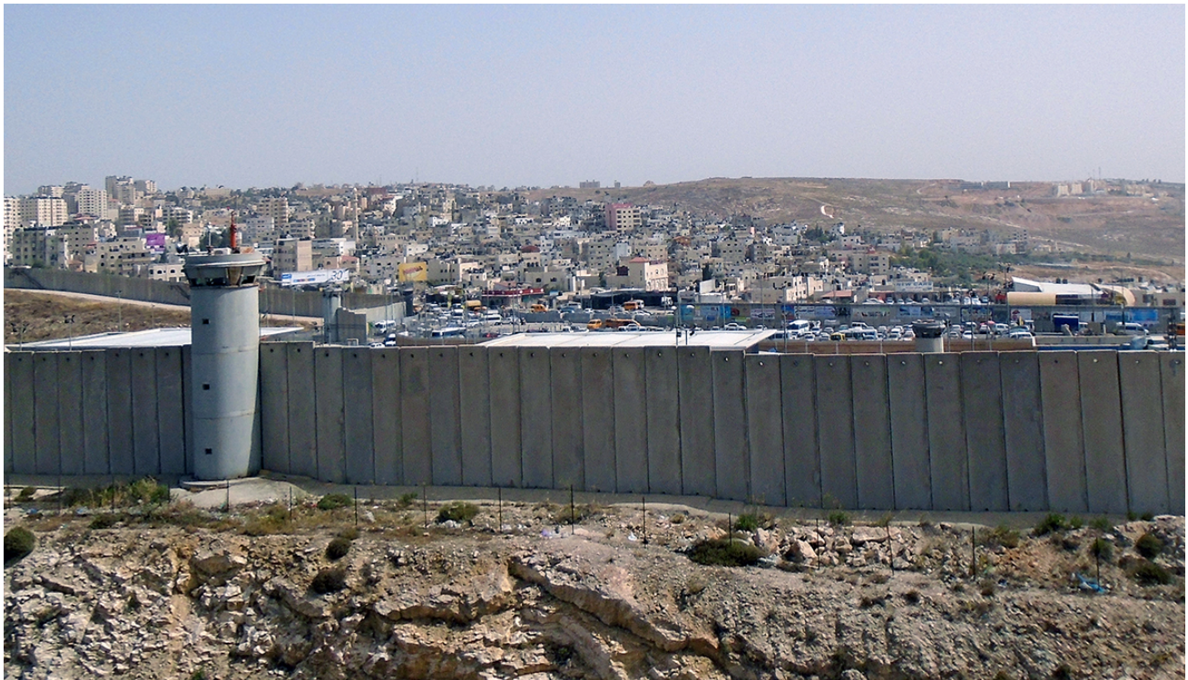
Figure 8. Separation Wall in the West Bank.

the academic community and different planning associations, reflecting on repressive institutional planning practises in the West Bank. ‘The philosophers have only interpreted the world in various ways. The point is, however, that planning changes it’—Marx would perhaps answer.