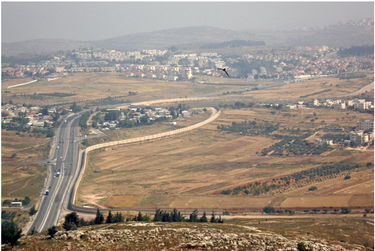
Figure 4. Separation wall cutting through the Palestinian landscape.

The proposals developed during the workshop focused on two scales: (a) regional scale, connecting the cities of the metropolitan region in a North-South direction,