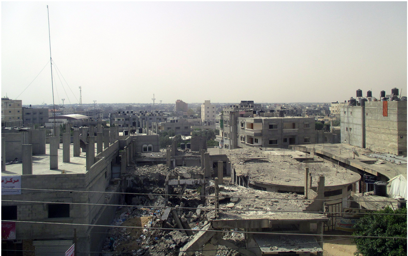
Figure 1. Khan Yunis in the south of the Gaza Strip. Destroyed or ruined buildings are a common impression in the dense urban pattern.

The urbanization gets amplified by rural-urban migration, better job opportunities (e.g. Nikisic, Nasser Eddin, & Cali, 2014) and a lesser impairment of daily practices due to mobility restrictions (e.g. El-Atrash, 2016). Scarcity of building land, limited means for mobilising building land complemented by presumed trends towards real estate bubbles (Palestine Economic Policy Research Institute—MAS, 2012) lead to a so-called housing crisis (Palestinian Central Bureau of Statistics [PCBS], 2007, 2015a, 2015b), stressing the little number of affordable houses available. Razeq (2015) reports an average amount of 1,450$ per month necessary to afford good quality housing for a family in Gaza. The number can be contrasted with a 40% poverty rate, the highest unemployment rate in the world and 70% of the work-