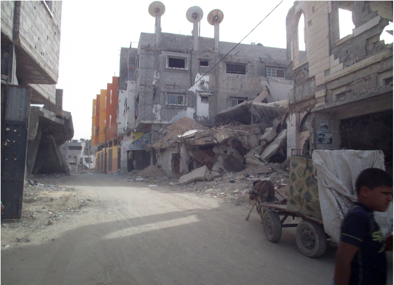
Figure 3. Demolition of housing suburbs in the Gaza Strip.