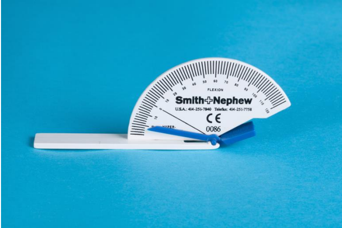
Photo 2. The tumorimeter.