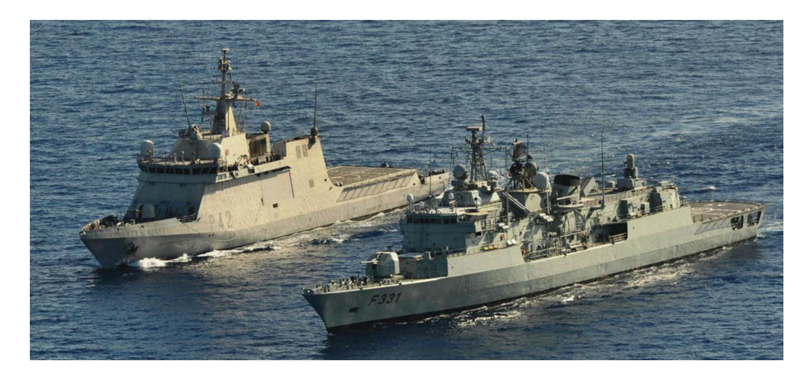
The EU's counterpiracy mission 'Operation Atalanta' off the coast of Somalia has been active since 2008.

maritime activity extends even further west than the Indian Ocean. In 2011, a Chinese warship was present in the Mediterranean Sea to assist in the evacuation of Chinese citizens from Libya during its civil war. A Chinese state-owned company, Cosco, is currently engaged in container port management in Greece (Van der Putten, 2014), and in the eastern Mediterranean the Chinese navy is escorting ships engaged in the chemical disarmament of Syria, operating from Cyprus.