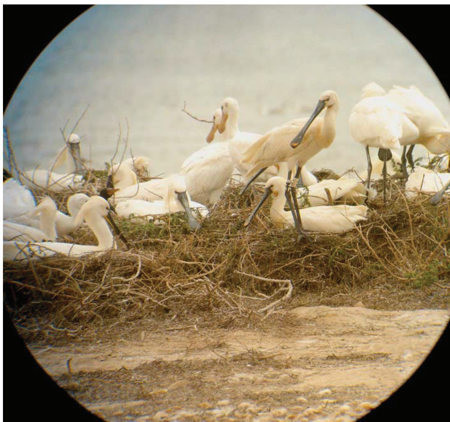
Figure 3. A colour-ringed bird born on Terschelling in 1997 standing on its nest on Nair (Banc d'Arguin) on 17 May 2010. A month later it was observed feeding chicks. Its partner (sitting on the nest) has a yellow bill tip. Given that male spoonbills generally have larger bills than females, the standing bird is probably a male.

studies on avian subspecies. A sample of studies on migrant bird species, although generally using slightly smaller sets of microsatellite loci, showed rather comparable levels of differentiation; in order of increasing F_{ST} : Dunlin Calidris alpina (three subspecies, 7 loci, F_{ST} \leq 0.010 ; Marthinsen et al. 2007), Canada Goose Branta canadensis (two subspecies, 6 loci, F_{ST} = 0.021 ; Mylecraine et al. 2008), Bluethroat Luscinia svecica (seven subspecies, 7–11 loci, F_{ST} = 0.042 ; Johnsen et al. 2006), Reed Bunting Emberiza schoeniclus (two subspecies, 6 loci, F_{ST} = 0.043 ; Kvist et al. 2011), and Piping Plover Charadrius melodus (two subspecies, 8 loci, F_{ST} = 0.104 ; Miller et al. 2010). Thus, with F_{ST} = 0.063 , the observed genetic differentiation between the two Spoonbill subspecies seems to fall in the upper range of values. On the basis of this comparison the subspecies status of balsaci seems entirely valid.