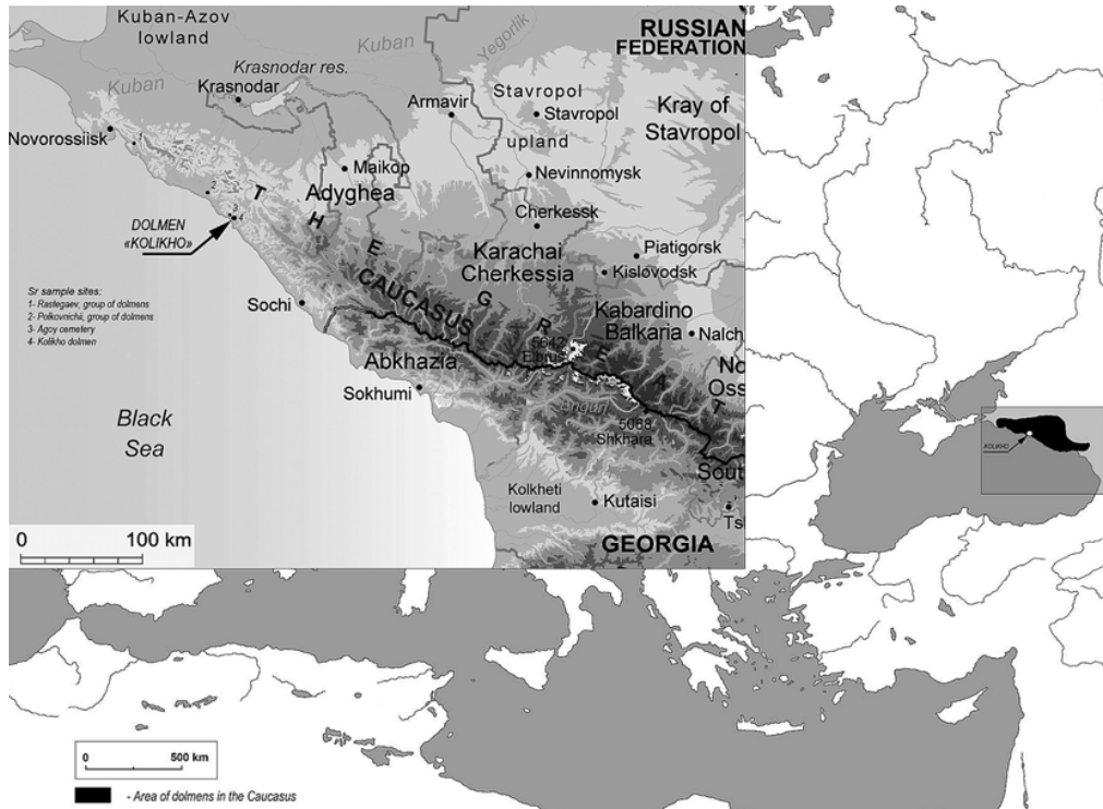
Figure 1 Map of the western Caucasus region. The Kolikho dolmen and Sr sample sites (1–4) are indicated