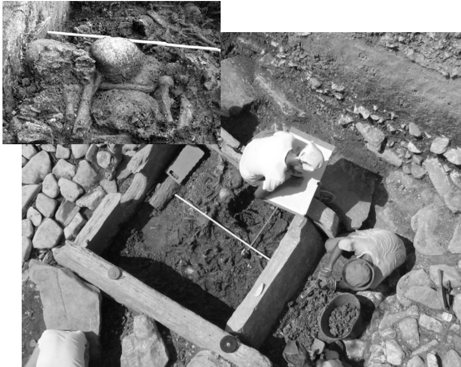
Figure 3 The Kolikho dolmen, showing the burial chamber and the human remains (detailed in top left inset)

The burial chamber was quite small: 1.3 \times 1.4 \times 1.5 m. It was packed with partly disarticulated skeletons of about 70 individuals (Figure 3). All remains were placed in the chamber through the entrance hole at the front. There are indications that the bodies were placed in the chamber after they were dried or defleshed. To obtain space on the stone floor in the chamber for each successive interment, the human remains of previous inhumations were moved to the side. Over time, this resulted in a stratified accumulation of human bones along the walls of the burial chamber.