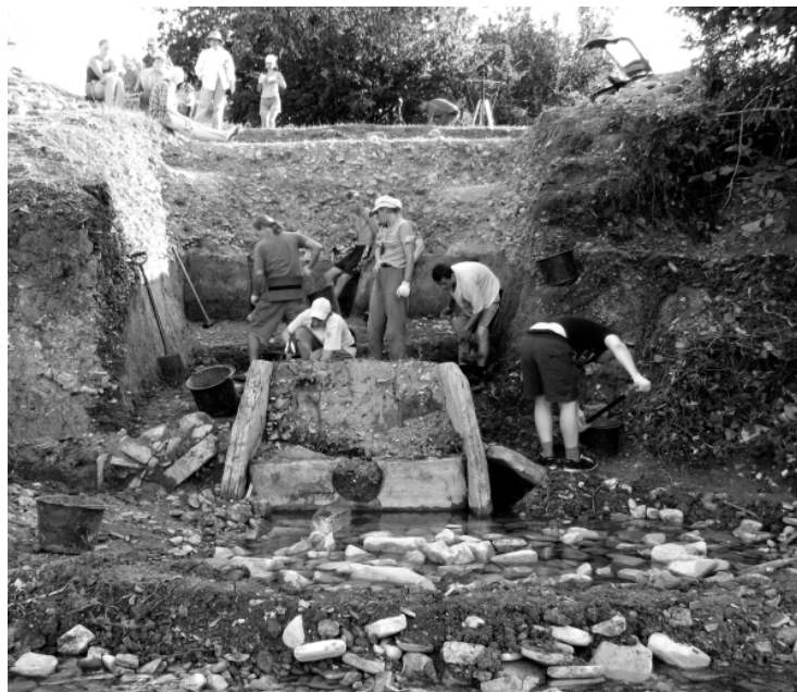
Figure 2 The Kolikho dolmen during the rescue excavation in August 2008