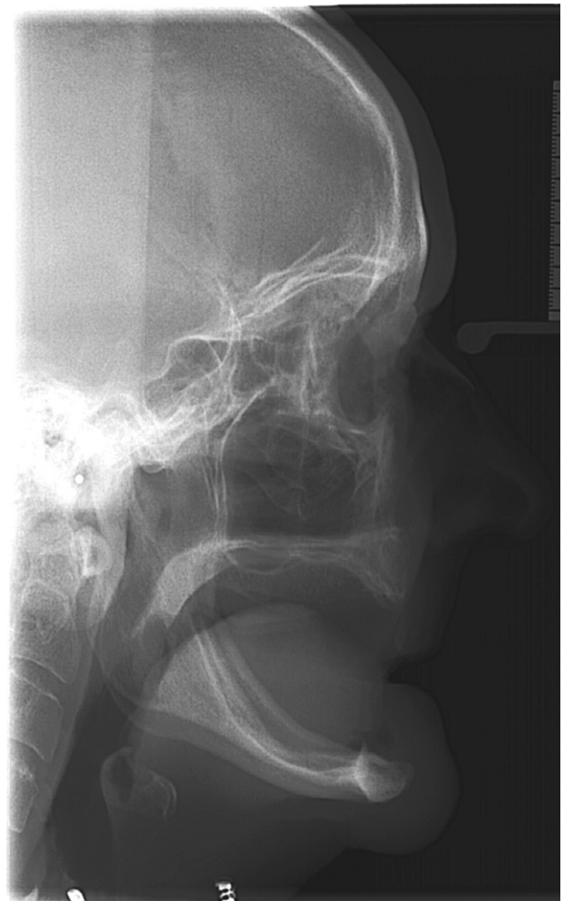
Figure 2 Baseline lateral cephalometric radiograph of the same patient as in Figure 1.

(plaque index, presence of calculus, gingiva index, sulcus bleeding index, and pocket probing depth) were scored 12 months after placement of the prosthesis and differences in patients' satisfaction between before treatment and 12 months after placement of the prosthesis.