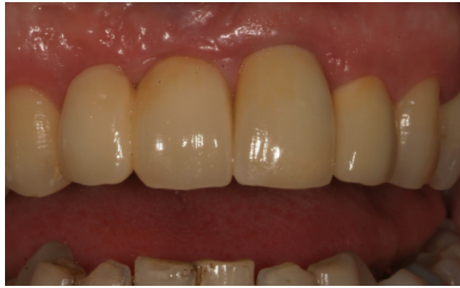
Fig. 1. Implant crown with a cantilever as a lateral incisor, dental implant located at the central incisor.