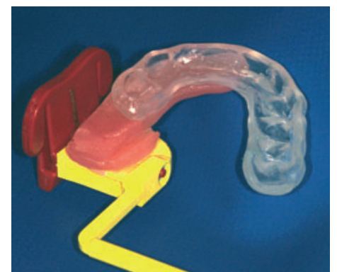
Figure 2. Individualized X-ray holder to make standardized intra-oral dental radiographs.

Before implant placement ( T_{pre} ), directly after implant placement (baseline or T_{0m} ), 1 month after the placement of the implant crown, which is 5 months after placing the implant ( T_{5m} ), and 1 year after placing the implant crown, which is 16 months after placing the implant ( T_{16m} ), digital peri-apical radiographs (Planmeca Intra X-ray unit, Planmeca, Helsinki, Finland) were taken using a paralleling technique. For each patient, an individualized X-ray holder was made to standardize the peri-apical radiographs (Fig. 2). The radiograph taken before implant placement was only used for diagnostic reasons to detect any infection of abnormality. The radiographs were analyzed using specially designed computer software to perform linear measurements on the digital radiographs (in cooperation with the Department of Biomedical Engineering, University Medical Center Groningen, The Netherlands). The calibration was carried out in the vertical plane for each radiograph, by using the known distance of several threads. This calibration ensured a correct measurement (Sewerin 1990). To assess the reliability of the radiographic examination, 30 radiographs of 20 patients (10 from each study group) were assessed by two examiners. The interobserver agreement was tested on 120 measurements (30 radiographs \times 20 patients \times 2 (mesial, distal) bone level assessments)