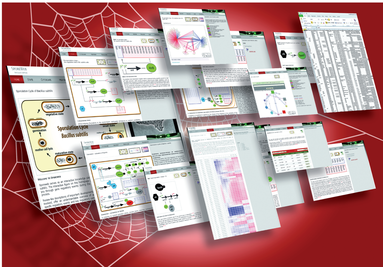
Figure 1. Graphical representation of the different levels in the SporeWeb Web site.

Sporulation-specific regulators and their regulons are described on individual pages, which can be accessed by