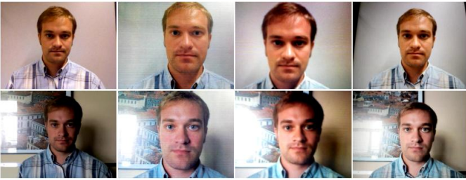
Fig. 1. Examples of real accesses and attacks in different scenarios. In the top row, samples from controlled scenario. In the bottom row, samples from adverse scenario. Columns from left to right show examples of real access, printed photograph, mobile phone and tablet attacks.

(1) hand-based attacks (the operator holds the attack media or device using their own hands); and (2) fixed-support attacks (the operator sets the attack device on a fixed support so they do not move during the spoof attempt). The first set of (hand-based) attacks show a shaking behavior which can sometimes trick eye-blinking detectors [8]. Figure 1 shows some frames of the captured spoofing attempts.