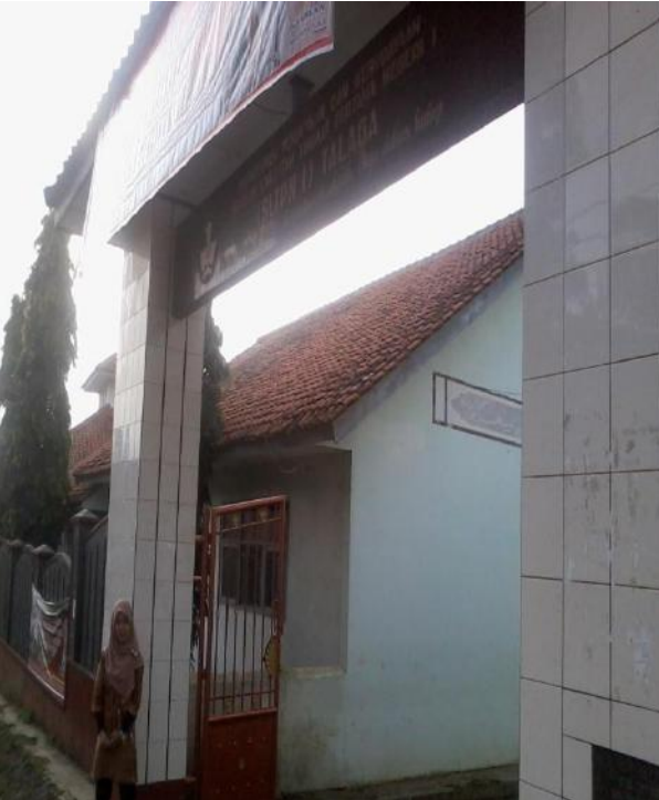
The Gate of SMP Negeri 1 Talaga