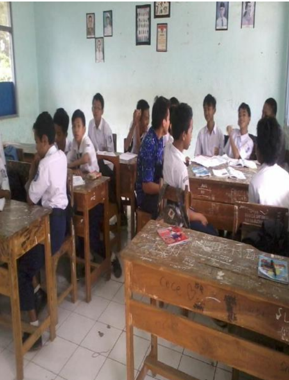
Group Work Activity