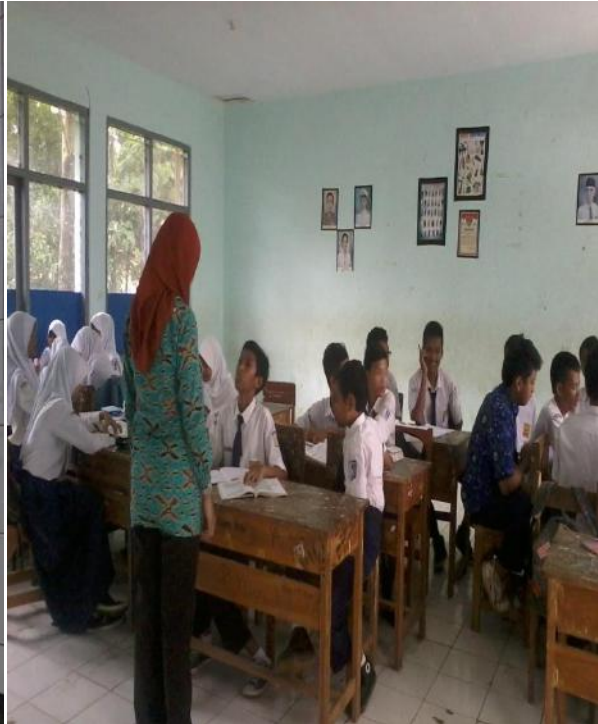
Teaching and Learning Process