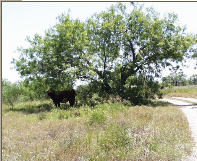
Figure 1. Bull seeking relief from the summer sun under a honey mesquite tree in South Texas.

Mesquite is native to Texas, where three major species and four varieties (Table 1) of mesquite occur. The most widespread species/variety is honey mesquite ( Prosopis glandulosa var. glandulosa ). When most people in the state talk about mesquite, they are probably referring to honey mesquite.