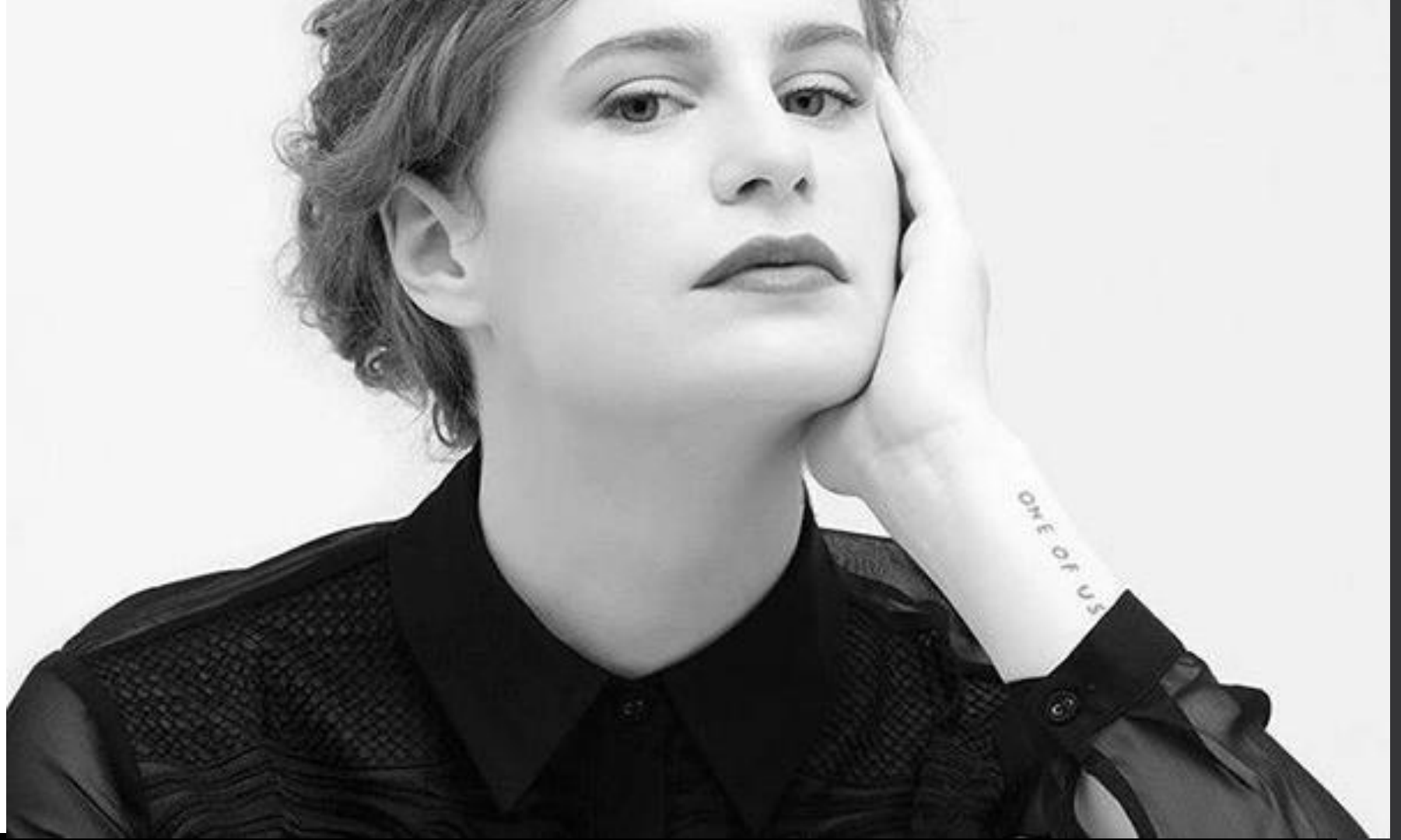
Christine and the Queens' Héroïse Letissier