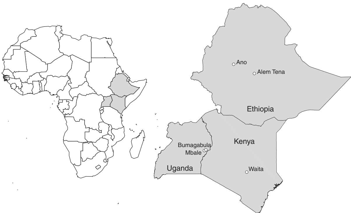
FIGURE 1 Maps of the five study locations across three countries in East Africa. See Table S1 and methods for more information

Soil erosion prevalence was scored at each subplot ( n = 640 observations per site), when erosion was observed in over half of the four subplots per plot, this plot was considered to be severely eroded (binary 0/1). Topsoil samples (0–20 cm) were collected at each subplot and