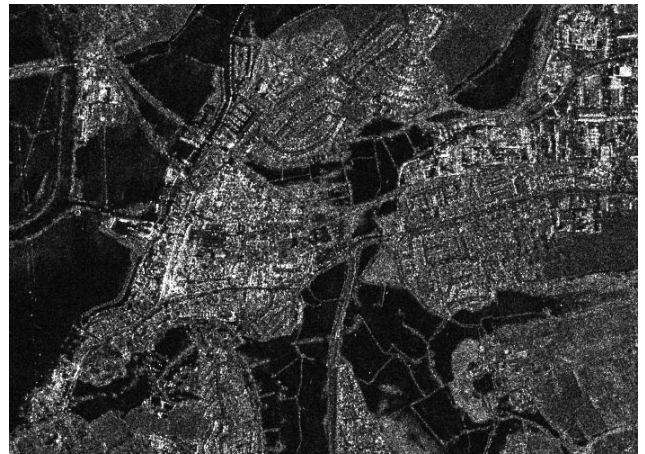
Fig. 1. TerraSAR-X image of Tewkesbury flooding on 25th July 2007 showing urban areas (3m resolution, 2.6 x 2km, dark areas are water, © DLR 2007) (after [5]).

Aerial photos of the flooding were acquired on July 24 and 27 [5], and these were used to validate the flood extent extracted from the TerraSAR-X image. The data set also included LiDAR data (2m resolution, 0.1m height accuracy) of the un-flooded Tewkesbury urban area acquired prior to the flood [5]. In the rural areas, an O.S. Landform Profile DEM generated from 1:10000 map contours and having 10m spatial resolution and 2.5m height accuracy was used as an example of a lower resolution, less accurate DEM that might be employed in areas not having LiDAR coverage. Finally, the data set included O.S. Mastermap data of roads, railways and embankments in the area, which would invariably be present in any simple GIS used by the emergency services.