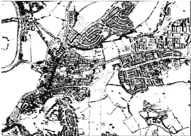
Fig. 2. Regions (black) unseen by TerraSAR-X in the LiDAR DSM due to combined shadow and layover (after [5]).

When the SAR image becomes available, the near real-time operations first try to detect the flood extent in the rural area, then use a secondary algorithm to detect it in the urban