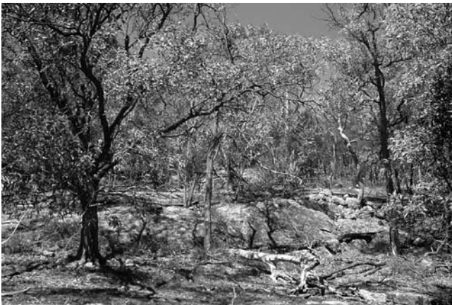
Fig. 3. Acacia blakei forests within the Mann River Nature Reserve.

(Hunter 2004). As with the previously described stands the understorey was sparse and open and the boundaries of the patches were clear and distinct within a general Eucalyptus forest and woodland matrix, although scattered Acacia individuals were commonly found in other forests and woodlands. The Acacia stands were mainly of even size within each patch though different patches were often different heights. In most patches the stems were 10–18 m tall, with stem diameters (dbh) averaging 22 cm (Fig. 3).