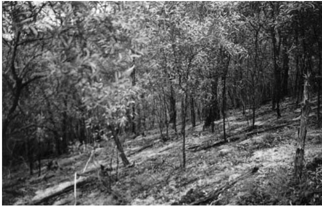
Fig. 1. Acacia blakei scrubs on the Demon Fault within the Demon Nature Reserve.

forms a distinct linear patch whose boundary is clear and sharp within a larger Eucalyptus forest. The understorey was sparse with scattered grasses and a few shrubs (Fig. 1). The height of most of the stand was only 4 to 8 m but some sections consisted of much older cohorts.