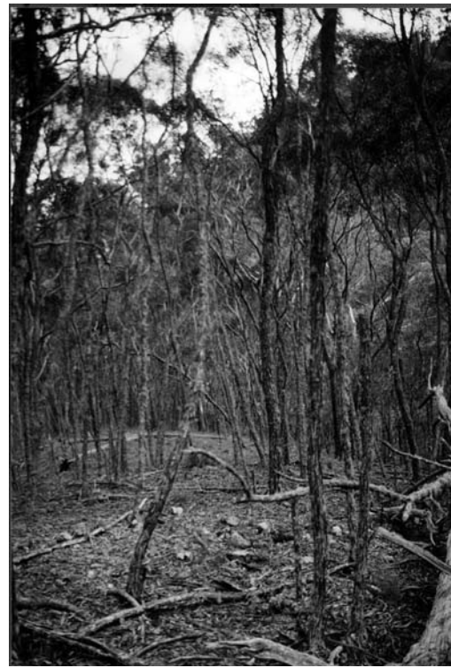
Fig. 2. Stand of Acacia blakei forest within Washpool National Park.

Stands of Acacia blakei forests and scrubs were found on steep north and western facing slopes in dissected metasediment gorge country within the Washpool National Park western additions (Hunter 1998). These stands occurred on shallow soils but had sharp and distinct boundaries with the surrounded Eucalyptus -dominated forests. The understorey was very sparse, with only a few grasses and some scattered smaller shrubs. The dominant Acacia blakei , up to a height of 20 m, formed a cohort of similar-aged individuals with little recruitment evident (Fig. 2). In floristic analyses this community was closely allied to rock outcrop assemblages which they sometimes occur around (Hunter 1998).