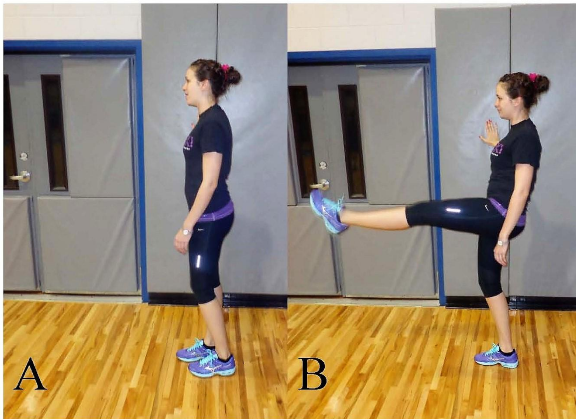
Figure 1. Beginning (a) and ending (b) positions for hamstring dynamic stretching exercises. See text for more information

two seconds. A metronome was used to pace the stretching routines. Stretching was performed five times at a slow rate, followed by 10 quick stretches performed as powerfully as possible without bouncing (Yamaguchi & Ishii, 2005). Stretching was first carried out on the left leg and, after a 20-second rest period, performed on the right leg (Yamaguchi & Ishii, 2005).