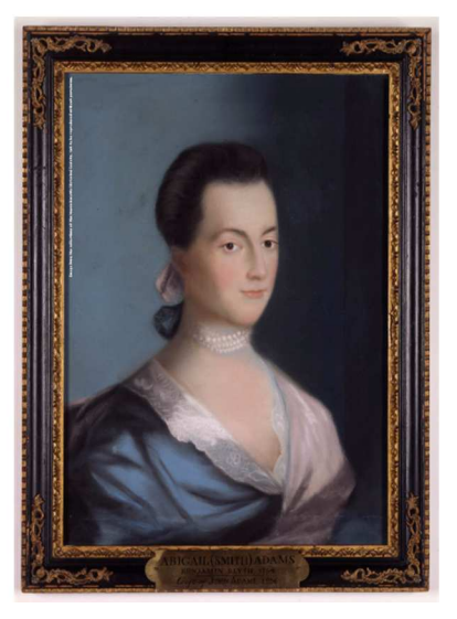
Figure 3: Benjamin Blythe's Portrait of Abigail Adams

Born in Weymouth Massachusetts in 1744, Abigail Smith was raised in a distinguished New England family. Despite their distinction, though, Abigail was brought up in a simple, rural neighborhood with little access to formal instruction. After learning the value of education and