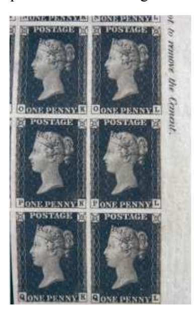
Figure 1: Penny Black <sup>7</sup>

By 1855, well after the American Revolutionary War, yet on the eve of the American Civil War, pre-payment of postage became mandatory in the United States. Pre-payment took form in adhesive labels much like the British Royal Mail's Penny Black . The Penny Black was the first adhesive stamp of its kind that boasted a profile image of Queen Victoria. Pictured in Figure 1 to the left, below, is the first postal stamp ever issued in Great Britain and in the world in 1840. The United States followed suit shortly after the adoption of their mandatory pre-paid postage with the five cent Benjamin Franklin and the ten cent George Washington in 1847; pictured below in Figure 2 on the right.