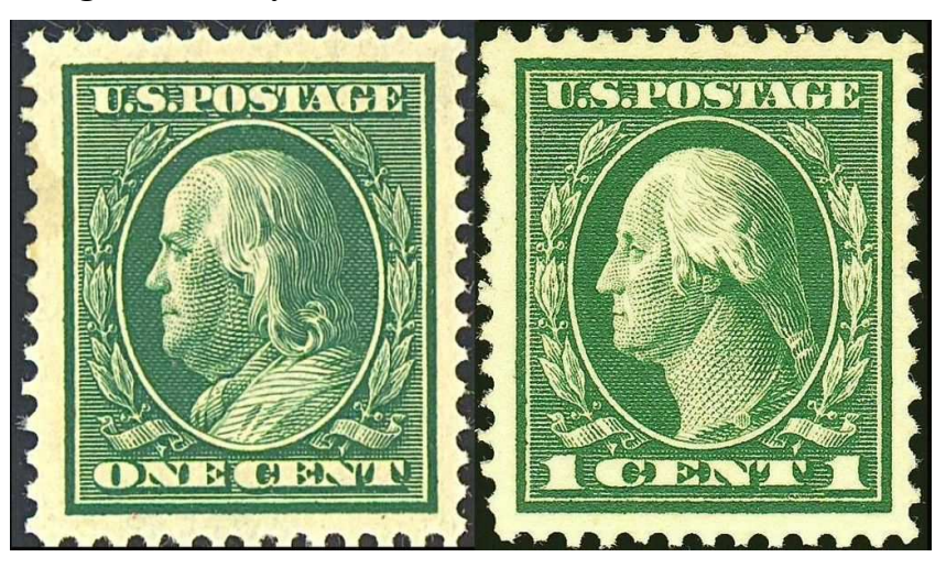
Figure 2: One Cent Franklin and Washington<sup>8</sup>

Commemorative postage stamps have always been an excellent way of honoring the memory of someone or something that has made a lasting impact on the history of the United States. In 1957. The Citizen's Stamp Advisory Committee (CSAC) was established to screen