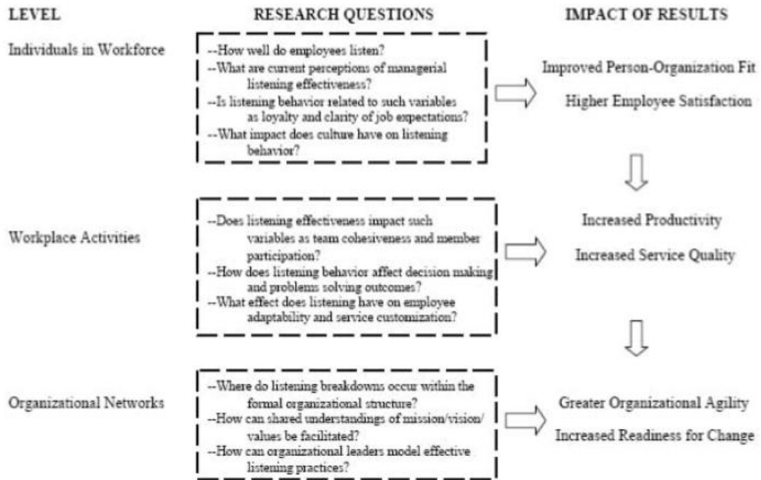
Figure 3. Listening research and hospitality practice.