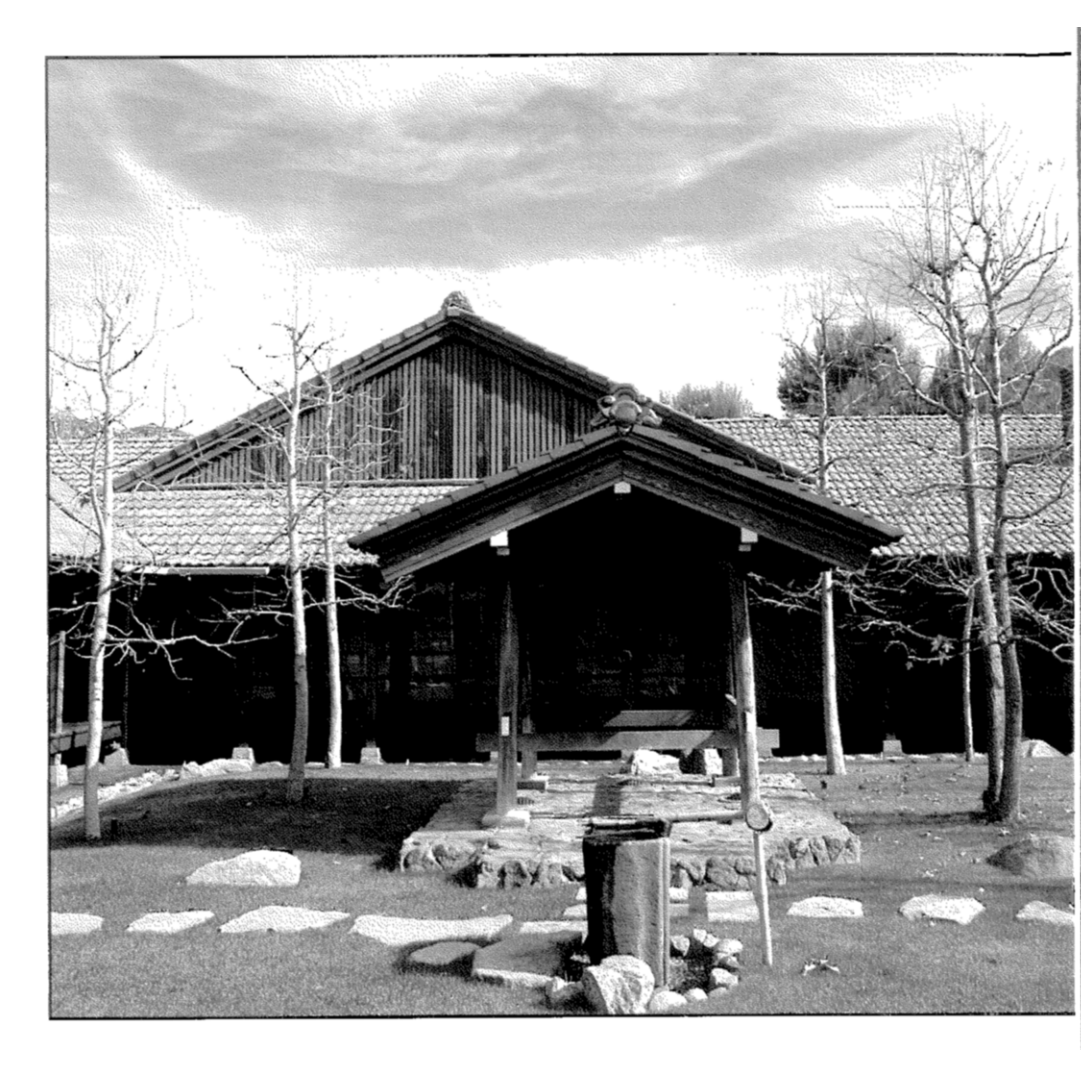
Like the Maine Chance, the Golden Door aims at the high-end market. The Golden Door focuses more on the health- and diet-related aspects of the spa experience.

Despite its modest price, the spa offers complete physical-fitness facilities, including sauna, hot tub, solarium, and racquetball. Its seasonal activities are lake swimming, cross-country and downhill skiing, and snowshoeing. It offers yoga