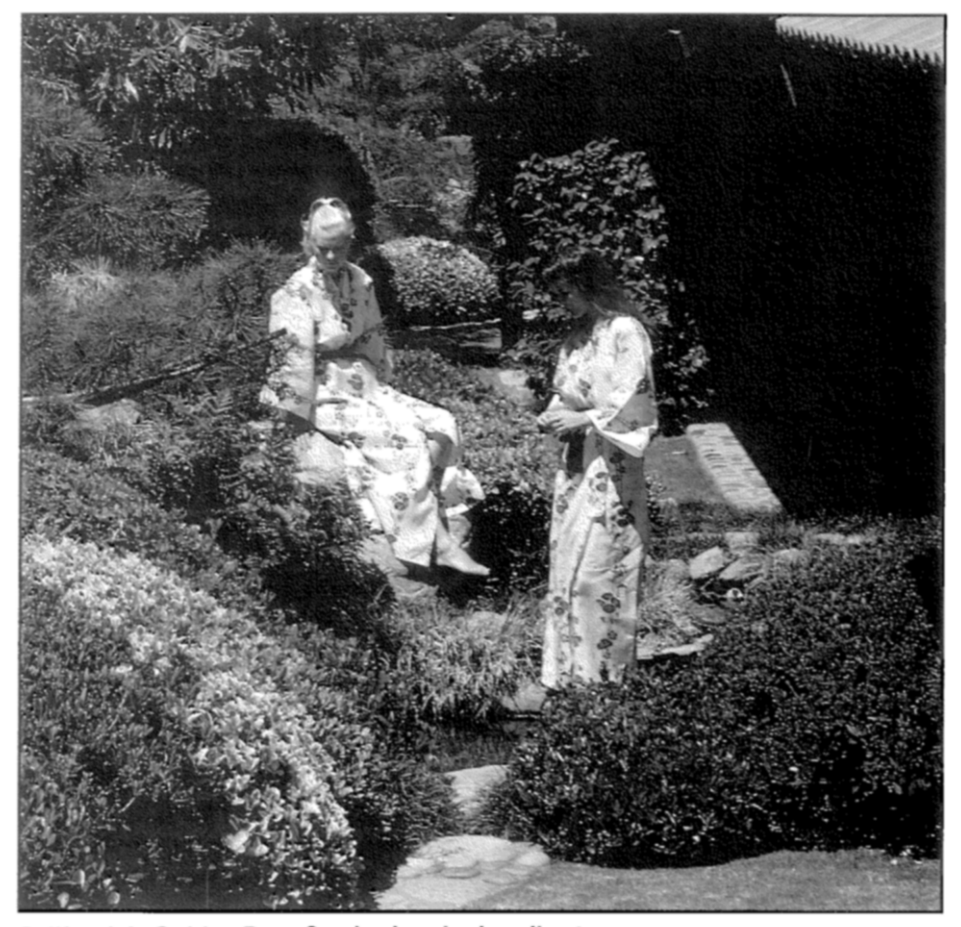
California's Golden Door Spa is aimed primarily at women.

Compared to the '20s, however, Americans today have far more leisure time. Despite this increased leisure, people are more jealous of that time and insist that time spent on any activity be worthwhile.