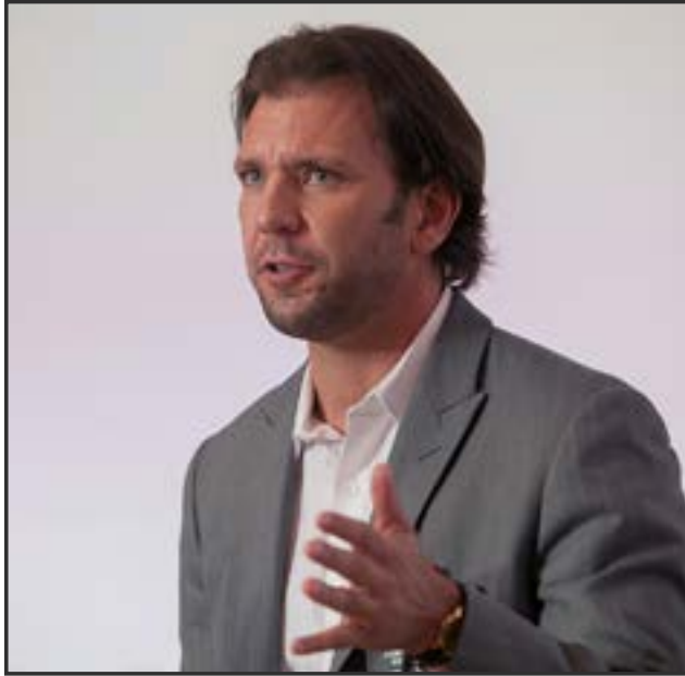
Carter Wilson: The hotels that you name in your competitive set should name you back. Most hotels have an “unconsidered set” of competitors.