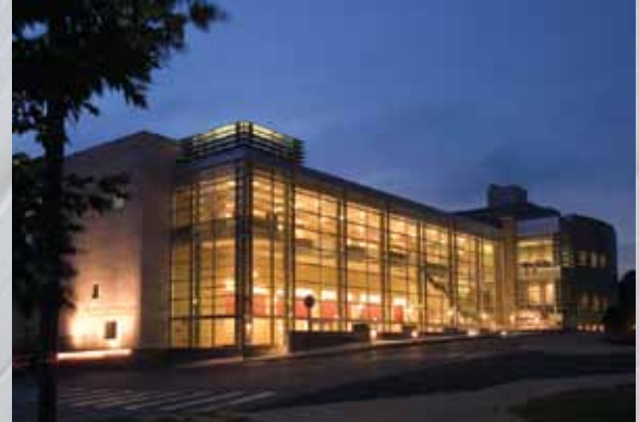
The Robert A. and Jan M. Beck Center at Cornell University