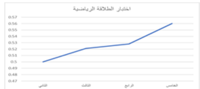
Figure (1): Graphic representation lines for the performance means of students on the mathematical fluency test according to the grade variable.

Notes from the table 9 indicates that the performance means of students on the test mathematical fluency increase across the higher grades. These differences and variations in the means for the fifth grade demonstrates that the performance is better in higher grades. It is further noted that the differences in means between the third and fourth grade is not significant, and that the mean for fourth grade was slightly higher than the third grade. The extent of the increase in the performance means on the mathematical fluency test is illustrated by the graph, as represented in Figure 1.