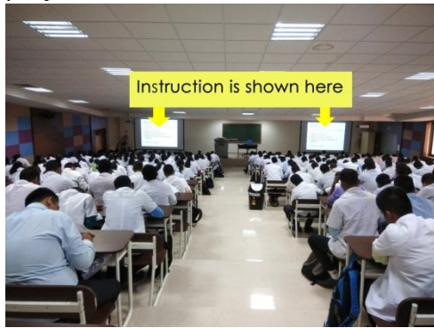
Figure 1: A lecture theatre with students writing answer for the question designed for SEdCA

projection screens in front of each division and green board in the center [Figure 1].