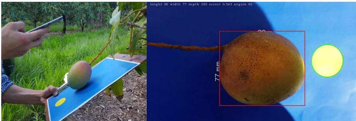
Figure 4. In-field imaging (left) and the result of fruit sizing mobile app (right)

Imaging fruit against the background and scale (Fig. 4), a R^2 = 0.95 and RMSE = 3.6 mm was achieved (n = 40 fruit).