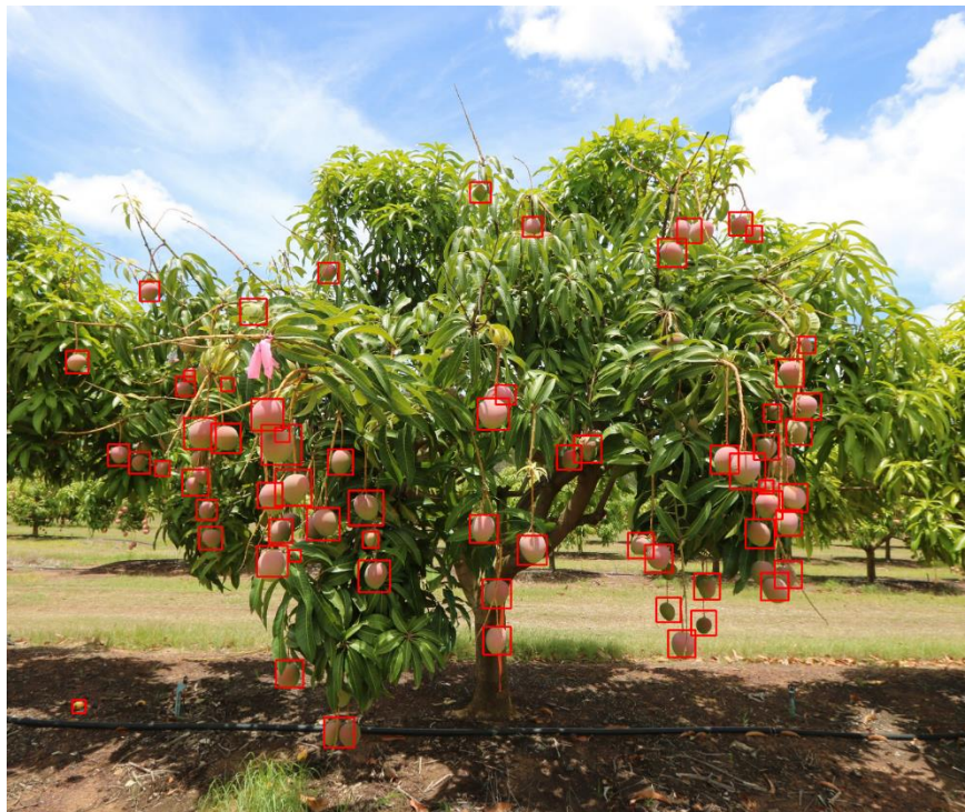
Figure 3. Fruit detection in the images