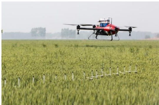
a. P-20 UAV spraying on wheat by XAIRCRAFT Co., LTD

Agricultural aerial spraying, which falls into both manned and unmanned platforms, is a critical agricultural aviation service providing efficient and effective application for crop pest control allowing for rapid response to sudden pest outbreaks of pests and the ability to apply crop production and protection products in terrain difficult for ground based systems, such as rice. Additionally, unmanned agricultural aviation spraying has the advantage of low labor operational costs with no damage to crops or soil physical structure due to wheel or track damage. Therefore, aerial spraying technologies has been widely used and promoted in agricultural production [4-6].