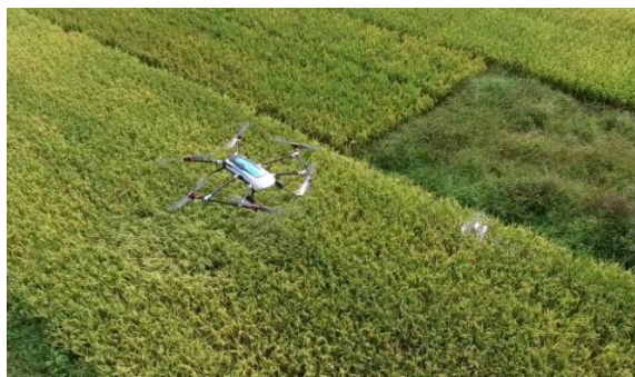
d. TXA-Xiangnong UAV spraying on rice by Guangzhou Tianxiang Aerospace Science and Technology Co., LTD