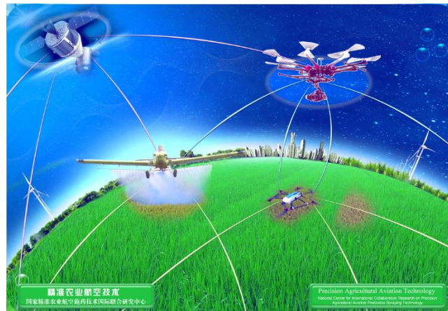
Figure 1. Precision agricultural aviation technology

technologies all combine to develop PAATs for use in agricultural protection and production practices. The research status and progress of PAATs are reviewed and summarized, with the three main components of remote sensing, aerial spraying and ground verification technologies highlighted. Based on the reviewed literature, trends in each component forecast are focused on key development directions in the areas of real-time image processing, variable-rate (VR) spraying, multisensor data fusion and real-time kinematic (RTK) differential positioning with the goal of promoting the further development of PAATs.