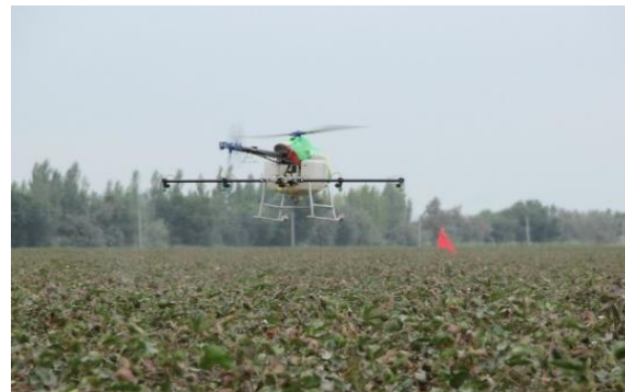
b. HY-B-15L UAV spraying on cotton by Shenzhen Hi-tech New Agriculture Technologies Co., LTD