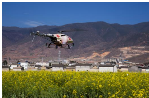
c. 3WQF125-16 UAV spraying on cole by Quanfeng Aviation Plant Protection Technology Co., LTD