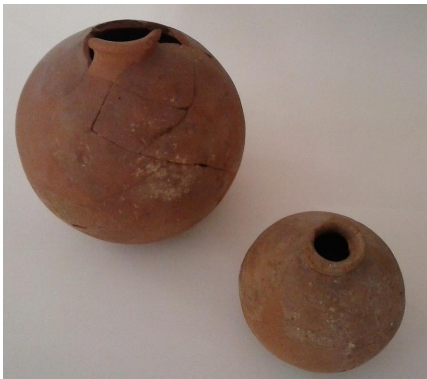
Figure 3. The ceramic grenades from the Priamar fortress (Savona)

Regarding the archaeometric study, the chemical (XRF) and petrographic (OM) analyses have showed that the Born grenades form a homogeneous production made using a calcareous (24.82% CaO) clay (Di Febo, 2016, Madrid Fernández et al., 2015). The optical observation by thin section showed a calcareous matrix, moderately oxidized and vitrified. The fine grained fraction (< 100 µm) is very abundant and formed by frequent calcareous microfossils partially dissociated due to relatively high temperature firing and micas which predominant on quartz, feldspar and micro-crystalline iron oxides. Very scarce coarser inclusions (about 400 µm, in few cases more than 1mm) are formed by fragments of mica schist and undetermined bioclasts due to firing process (Figure 4). Secondary carbonates filling vacuoles are also observed. The fine fabric, the carbonate-rich composition and the presence of calcareous micro- and macrofossils point to the use of poorly modified marine sediments (Di Febo, 2016) well compatible with the Pliocene marls diffused in the Barcelona area (Riba and Colombo, 2009, Ventayol et al., 2002). Considering the type of clay normally used for making fire pots, one might expect non-calcareous clays in the production of these grenades. In this case, the use of calcareous clays might suggest that grenades had been manufactured with raw materials not deliberately selected and available during the Bourbon military siege.