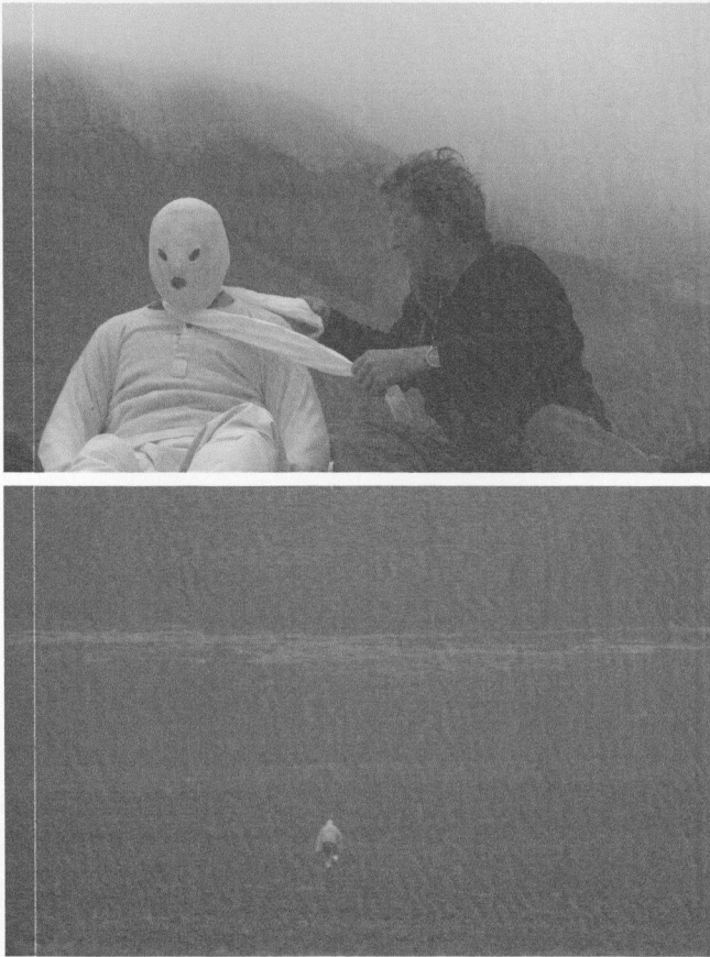
FIGURE 2. Lead author disguised as a polar bear approaching a group of Svalbard reindeer. Limited supplies of white clothing left the back of the observer uncovered.

displacement distance by the reindeer after taking flight. All response distances were measured with laser monoculars (Leica Rangemaster 1200 Scan; 1 m accuracy at 1000–1200 m).