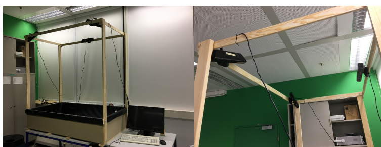
Figure 2 - Early prototype of the VR sandbox

Hardware Design. The sandbox has a volume of 140 x 80 x 30 cm. The ground and the inner walls are covered with pond foil. This size provides a good balance for single user as well as for collaborative scenarios in the future. For tracking, three Kinects v1 are mounted on a railing at a height of 120 cm above the sand surface. The tracking volume is captured from three angles of an isosceles triangle, by that reconstructing a full 3D point cloud of the sand model. For virtual reality, a HTC Vive [11] is used, also opening the opportunity to track additional objects. A Leap Motion [12] sensor, mounted to the HMD, provides information about the user’s hand and arm positions. Besides rendering for an enhanced immersion, the volume occupied by the hands is subtracted from the depth data coming from the Kinect sensors. The application runs on a Windows 10 System with an Intel i7 3,4 GHz and 16 GB of RAM. The full setup is shown in Figure 2.