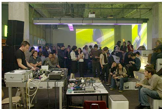
Figure 4. The author in concert at »Club Transmediale«, Berlin, 2004.

Ambient also denotes a physical spatial situation, an installation, a place where ambient situations can be created. To the techno generation such settings are known from the chill-out rooms of the 1990s where ravers would relax after the exertion on the dance floor, listen to relaxing music without beat and occasionally consume drugs. In no time, these chill-out rooms developed into listening rooms, spaces for sound art, since ambient DJs would often play new, hitherto unheard sounds, sounds that soon did not merely create a contemplative atmosphere, but astonish the public and start processes of imagination and immersion. As opposed to the concert hall, music in these spaces is played in the background, non-centrally and omni-directionally. It is an artificial acoustic environment and on a perceptive level merges with conversations, projection of images, lighting and so on. A typical ambient situation: