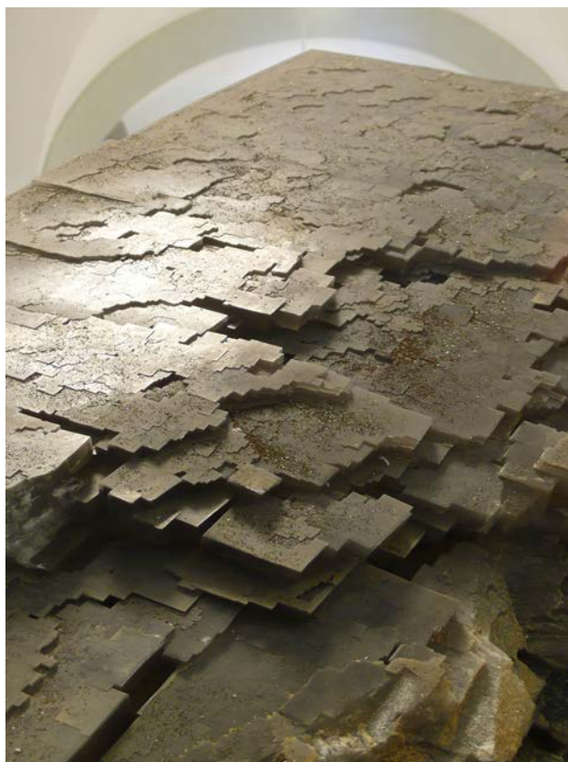
Figure 5. Calcite from the Gonzen mine, FocusTerra , Department of Earth sciences, Swiss Federal Institute of Technology Zurich (ETH).

relationship of territory and the earth« [25]. The plane of immanence is the perception of the world, »being thinking«, »nature thinking«, an absolute horizon of terms and events of the real and the possible, it can be understood as a conception of the environment, as the cosmos that can be grasped by thought which within Uexküll's system of »Merk-« and »Wirkwelten« ideally encloses »the farthest plane«. There are as many levels as there are subjects, they interfere with each other – the plane of immanence is porous, foliated. Under the levels of »here« and »now«, there lie older layers of world conceptions, forming a history of thought: