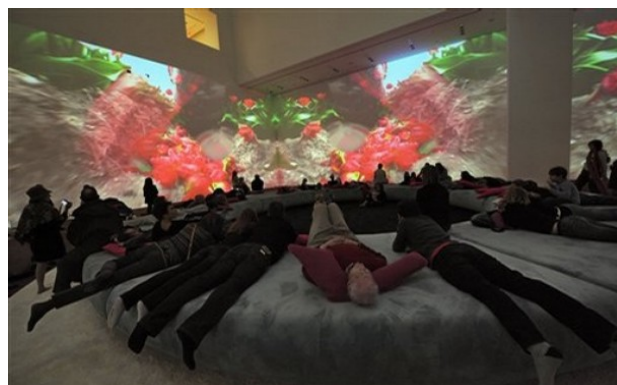
Figure 2. Pour Your Body Out (7354 Cubic Meters) , an audio-visual installation by Swiss artist Pippilotti Rist at MoMA New York, 2009.

Of eminent importance for these considerations is the (musical) relationship between subject and environment: The environment had in pre-historical times already been conjured through analogy, mimesis and aesthetical means in order to be able to understand and cope with it in the framework of an immersive setup. This is witnessed by early cave paintings that are mostly found in spots that also have good acoustics. There is good evidence that people aimed to achieve a high degree of immersion, to amplify their »Umwelt« by audio-visual means. Hanns-Werner Heister calls such acts »mimetical ceremonies« [8], a term coined by Georg Knepler [9]: