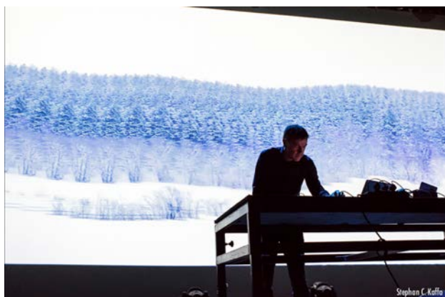
Figure 3. Biosphere (Geir Jenssen) live at State-X New Forms, Paard van Troje, Den Haag, 2013.

In order to describe present-day ambient music, one must point out the marked change that »ambient« has undergone since the term was coined by musician Brian Eno in 1976. Ambient as a musical style has evolved into a set of reception modes and terminologies within which electronic/digital music as well as visual arts are conceived and perceived and where »Umwelt« is being reflected. Nowadays, the works conceived within the context of ambient culture are quite different in several respects from the original form of ambient music close to pop culture, the rather esoteric »cosmic music« of the 1970s [11]. In the past few years, ambient art and music presentations have occasionally been classified with terms such as environmental art [12] or ambient poetics [13]. Several musical forms have evolved that are closer to concepts within the visual arts than pop or orchestral music. Marcus Kleiner called such forms »media music« [14]. If one speaks of media music in the context of ambient, technologies and communication forms hitherto not used in music are involved in the making and contextualization of music: medial artifacts and fragments; design elements, network technology, scientific figures and so on. Thus, the term media music not only denominates the medial, substantial and aesthetical polyphony inherent in ambient, but also technological innovations in music production that have turned media technologies into music technologies (above all, the computer).