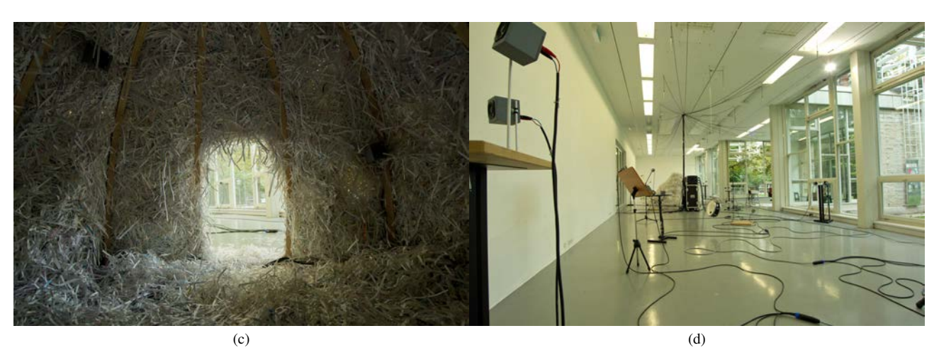
Figure 1: Photos from the final installation setup in the Forum Stadtpark exhibition space.

real-time DSP programming environment written in C. rat tle can also be used as a mass-based physical modelling server, a feature we used in the final realisation of the installation. This programming environment is based on an interpreter written using CLANG and LLVM<sup>2</sup> that is used to define and JIT-compile new functions in real-time thus allowing for rapid prototyping and audio synthesis[14].