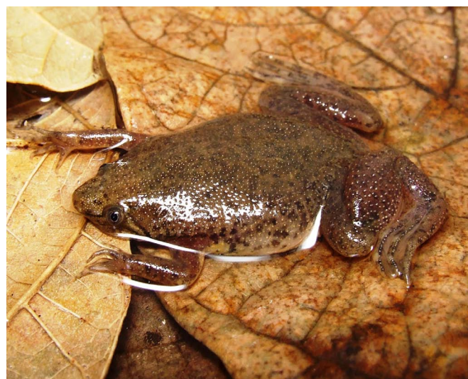
FIGURE 1. Pipa carvalhoi (MZUFV 8671, female, in life) from Sete Cachoeiras, municipality of Ferros, Minas Gerais.

2008). Herein we present data on the distribution of P. carvalhoi in the southeast of Brazil, as also new records in state of Minas Gerais, improving the knowledge about its geographic distribution.