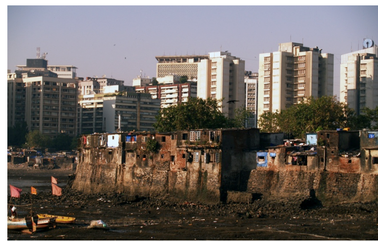
Figure 2: Mumbai

Figure 2 shows this formal/informal juxtaposition at a larger scale where an informal settlement lines the coast of Colaba in Mumbai with the formal city on higher ground. Again it is possible to read this as simply poverty and underdevelopment, or even as a development opportunity. Yet it is now very clear that such settlements are functionally integrated parts of many cities and cannot be simply erased without moving the informality somewhere else. Informal settlements have been the most pervasive single form of new urban development over the past half century, housing around a quarter of the global urban population (UN 2006). Understanding the complexity and resilience of informal urbanism is one of the great urban challenges of our time.<sup>1</sup>