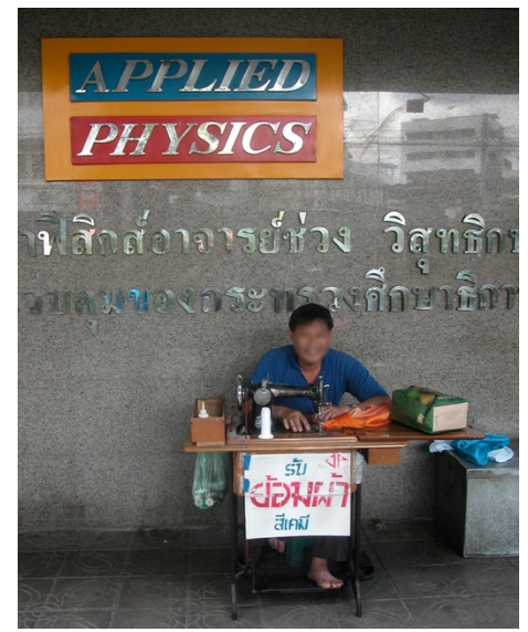
Figure 1: Bangkok

I want to start with two images of cities at very different scales. Figure 1 was taken in Bangkok a few years ago. While the sewing machine is old we all know that this pedal powered machine has stood the test of time – mobile, sustainable, adaptable. We can also read into this image that a corporation formally owns or rents the modern building and that this use of the sidewalk is informal (although there may be some money changing hands). This may be, for some, simply an image of poverty or underdevelopment, but it is much more one of entrepreneurial flexibility, adaptation and creativity.