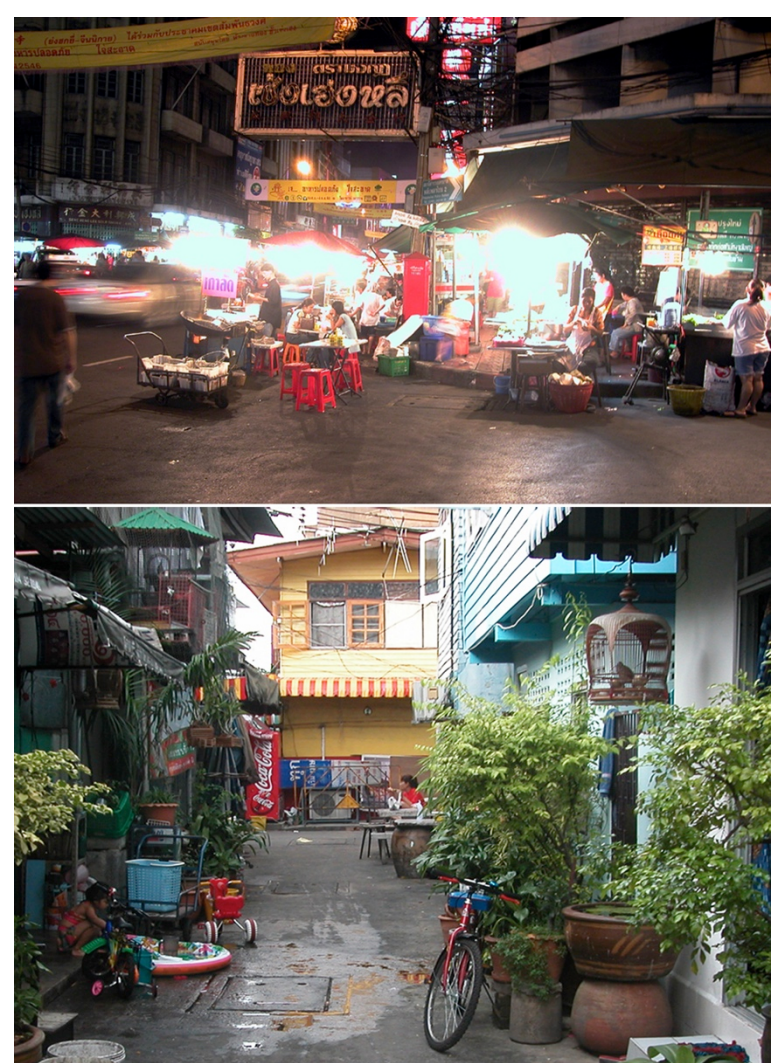
Figure 3: Ban Panthom, Bangkok

rules and regulations; and everywhere they are transgressed. Yet this is a home and community for a rich mix of people and a vast range of productive leisure and consumption activities. The levels of informality are not uniform, increasing both with night and depth within the labyrinthine spatial structure. It is often the deeper layers of this urban assemblage that are the most livable, most resilient and least legal.