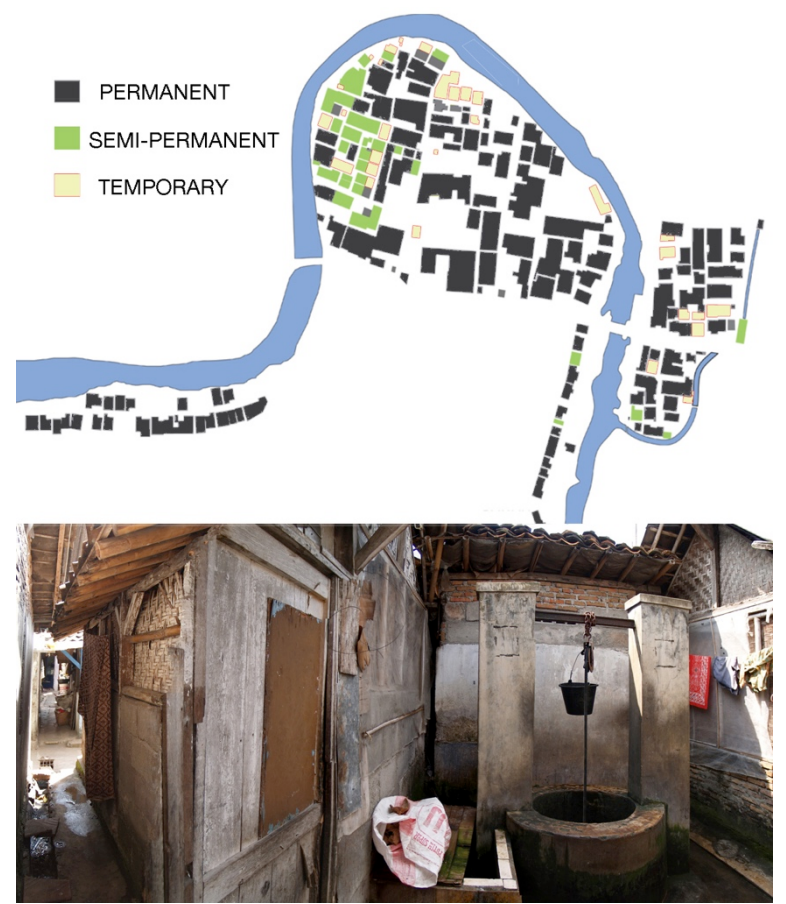
Figure 4: Sidomulyo, Yogyakarta

support and new settlements along the riverbank. Complex processes of land speculation take place without formal ownership. The state cannot easily remove or upgrade such a settlement, many parts of which are on private land, and they cannot legalise the squatting without stimulating further encroachments. The result is a complex adaptive assemblage that becomes resilient to major change. For those who want informal settlements erased or quickly upgraded into formal settlements this can be frustrating. For those who live there this is the way everyday life is sustained. Informality is the means by which these people gain a house and (eventually) tenure.