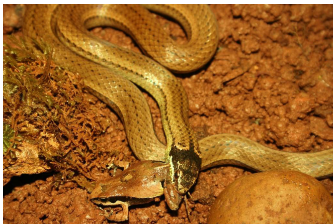
FIGURE 1. A male specimen of Taeniophallus affinis (CRUPF 1698; SVL = 502 mm) eating a frog ( Physalaemus gracilis ) collected in Sertão, Rio Grande do Sul, Brazil.

Taeniophallus affinis (Günther 1858) is a snake of the family Dipsadidae with a wide distribution in the Atlantic Forest of southeastern and southern Brazil (Di-Bernardo and Lema 1988; Di-Bernardo 1992). It occurs from the southeastern part of the state of Minas Gerais to the states of Espírito Santo, Rio de Janeiro, São Paulo, Paraná, Santa Catarina, and Rio Grande do Sul. The southernmost record of this species is from the northeastern part of the state of Rio Grande do Sul (Di-Bernardo and Lema 1988; Di-Bernardo 1992). The natural history of T. affinis is poorly documented; it is terrestrial, living amidst leaf litter and its diet consists of anurans and lizards (Marquez et al. 2001; Condez et al. 2009; Zacariotti and Gomes 2010).