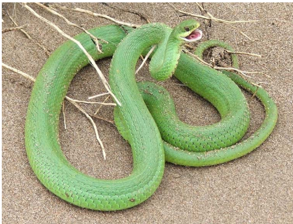
Figure 1. Green snake ( Philodryas aestivus ) found at the mouth of river Quequén Salado, Buenos Aires.

In spring of 2006, we found an adult green snake (Figures 1 and 2) in the Atlantic coastal zone of southern Buenos Aires (Figure 3), ca. 170 km southeast from its previously known southernmost distribution area of Sierra de La Ventana. We observed the specimen on a bare-soil sandy plain at the Quequén Salado River mouth (38°55'44.43" S, 60°30'42.02" W), next to a marine beach, 5 km east from Marisol village (Partido de Coronel Dorrego). Due to lack of authorization for specimen collection, we photographed the snake with a high resolution digital camera, which made possible its determination as a Philodryas aestivus . The pictures are stored in the Museum of Natural Sciences of La Plata (cf. 0047-0050).