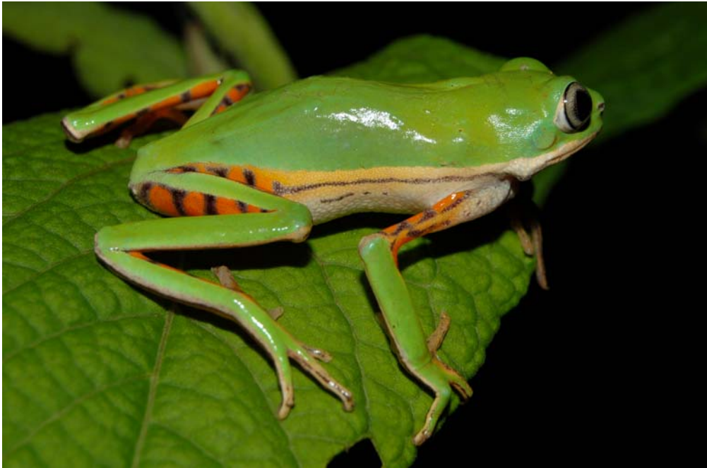
Figure 1. Phyllomedusa azurea from Porto Velho, state of Rondônia, Brazil.