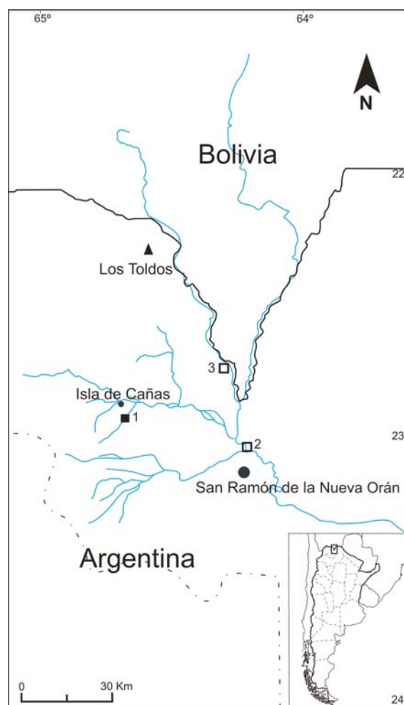
Figure 1. Distribution map showing type locality (black triangle) and new distribution records (squares) of E. skotogaster : (1) voucher specimen (MLP.A. 4900) locality, near to Isla de Cañas; visual and auditory detection near to Río Piedras (2) and to Aguas Blancas (3).

Adult calling males and one metamorphic specimen of E. skotogaster were seen or heard in small temporary ponds formed at the margins of the Ruta Nacional number 50, near to the intersection with the Río Piedras (23°4'50" S, 64°19'47" W; 350 m) upstream Aguas Blancas (22°45'17" S, 64°20'47" W; 410 m), both located in Orán department, Salta province, Argentina (Figure 1).