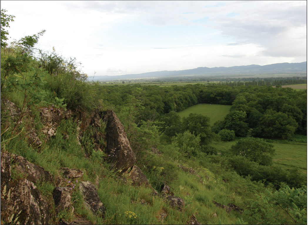
Figure 4. Habitat of S. chrysotosella in Georgia, Gremi.

strongly hirsute, apex sharp, weakly pointed inwards; transtilla lobe relatively long, digitate, apically with some fine setae; posterior margin of vinculum medially with broad rounded indentation, laterally formed as sub-triangular plate, distally covered with fine setae; saccus broad, rounded; basal half of phallus almost round, distal part relatively slender, tapered apically; ankylosed by strongly sclerotized and tightly attached anellus.