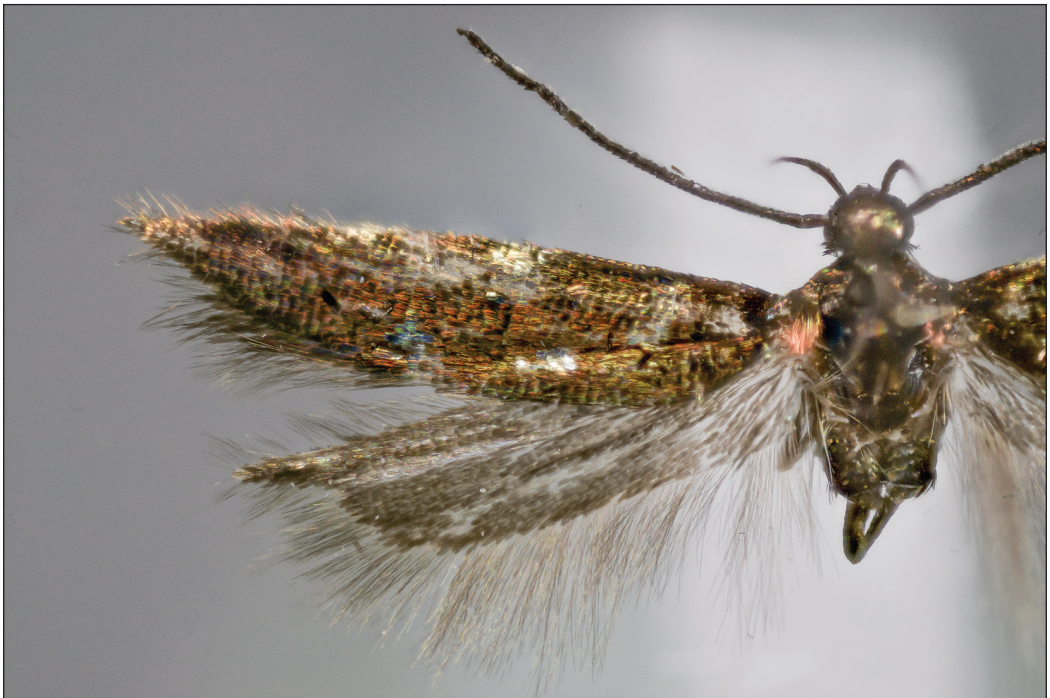
Figure 1. Adult of S. chrysotosella sp. n. (Paratype).

Male genitalia (Figs 2, 3). Sternite VIII broad sub-rectangular, laterally rounded, with broad anterior projections on both sides, posterior margin broadly rounded with weak medial indentation. Tegumen relatively short with V-shaped anterior margin; uncus formed as almost sub-rectangular plate, except with posterior margin broadly extended medially, latero-medially with two strong setae and with 6–8 short and thinner setae; valva twice as long as tegumen, elongate, apical half