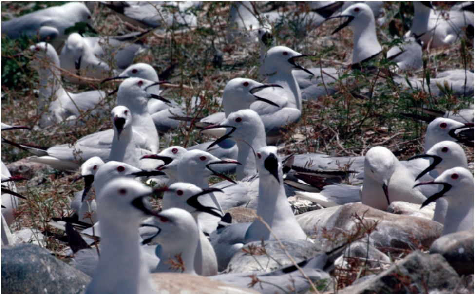
Figure 2. Larus genei at Dukan Lake (S2) in summer 2008.

Destruction of habitats by gravel mining and tree cutting and other major threats to birds, such as uncontrolled hunting, were prevalent throughout the survey area, as