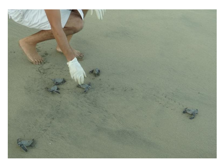
Figure 3. Releasing of leatherback turtle hatchlings in the sea by a Save Our Sea Turtles (Tobago) volunteer.

community based organization, founded in 2000 with a mission to conserve Tobago's sea turtles is already giving results. Regular patrols help disoriented hatchlings to find the sea and prevents poaching of these remarkable creatures (see Figure 3 and supplemental video).