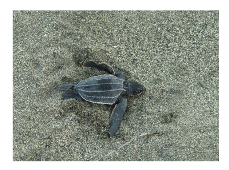
Figure 2. A disoriented hatchling has died of dehydration.

At present the most effective measure to prevent turtle hatchlings disorientation are beach patrols. The work of Save Our Sea Turtles (SOS) – a registered