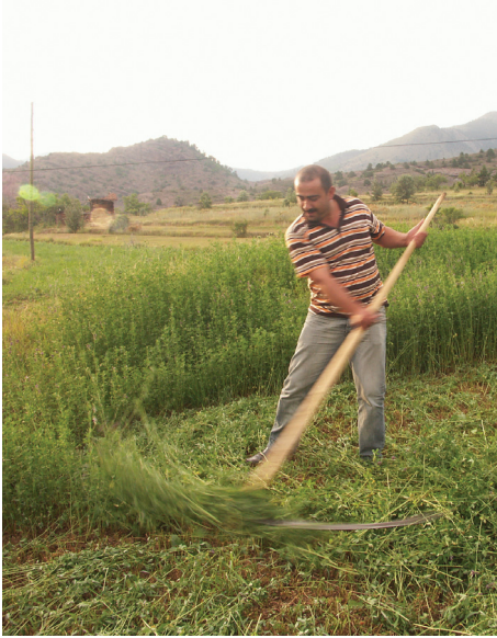
Traditional hay making provides optimal conditions for many butterflies.

intensification still causes major losses and is a particular threat to member states in eastern Europe, e.g. Poland and Hungary. Abandonment can temporarily lead to good conditions for many species, but will soon lead to scrub encroachment and eventual loss of suitable breeding conditions as open grassland turns to woodland. The maintenance of open grassland is thus essential, usually by the maintenance of active traditional pastoral systems, including livestock grazing and hay cutting. The extensive use of fertilizers should be avoided. Socio-economic conditions will need to be considered to ensure such pastoral systems survive.