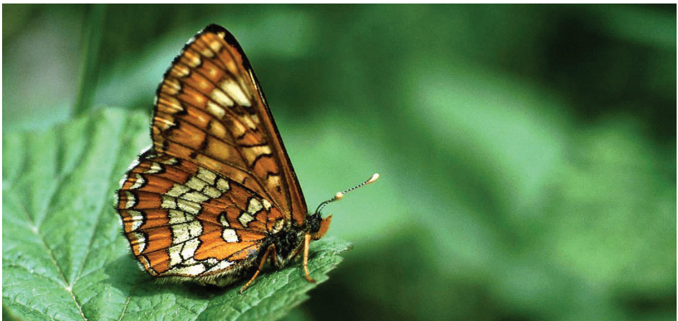
Euphydryas maturna .