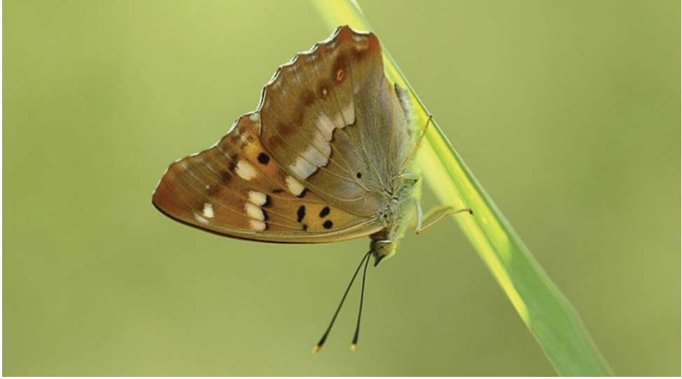
Apatura metis .