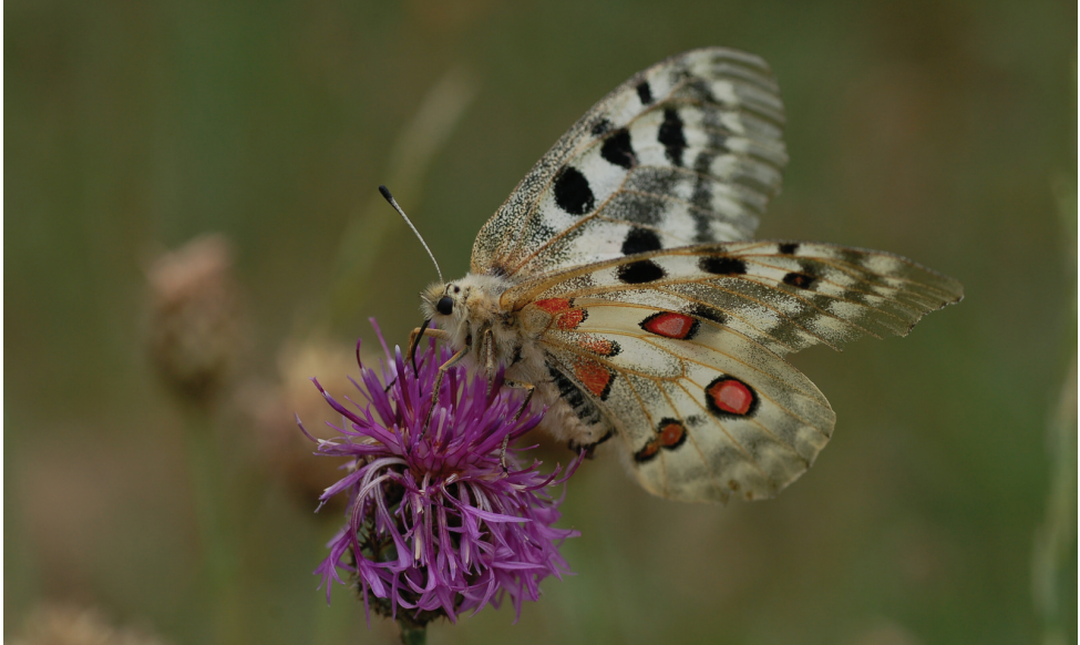
Parnassius apollo .

is legally protected in many countries. In spite of this legal protection, there is often no special attention to the habitat management. As a consequence many small lowland populations are in decline. The production and implementation of local species action plans are urgently needed.