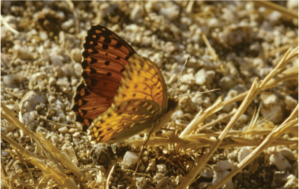
Argynnis elisa.