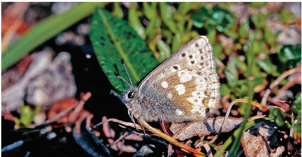
Plebejus aquilo .