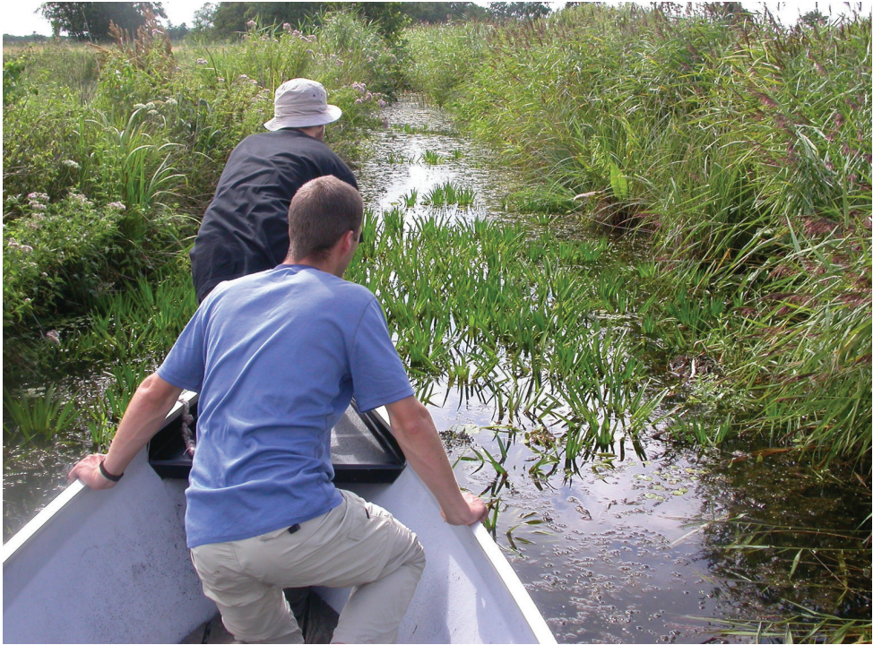
Habitat Lycaena dispar , Netherlands.

for the females. Eggs are laid on docks ( Rumex spp.) like R. crispus , R. obtusifolius and R. hydrolapathum , but never on sorrels (like R. acetosa or R. acetosella ). The young caterpillars first eat from the underside of the leaves, making the characteristic 'windows'. Later caterpillars feed on the whole leaf. They hibernate when half-grown between withered leaves at the base of the foodplant. They are sometimes associated with ants ( Myrmica rubra and Lasius niger ). The Large Copper has several subspecies in Europe. The largest of them, L. d. batavus , is confined to the extensive wetlands in the north of The Netherlands. The males of this subspecies occupy territories in the warmest places in depressions in the vegetation. Their caterpillars feed only on Water Dock ( Rumex hydrolapathum ). There are two smaller (and less threatened) subspecies, L. d. rutilus and L. d. carueli that use also other docks as foodplants. The subspecies L. d. batavus has one generation a year and the other subspecies one, two or sometimes even three. Habitats: humid grasslands and tall herb communities (26%), water-fringe vegetation (14%), fens, transition mires and springs (11%), mesophile grasslands (8%), broad-leaved deciduous forests (7%), blanket bogs (5%), dry calcareous grasslands and steppes (5%).