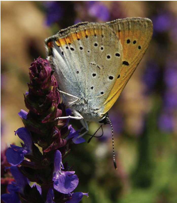
Lycaena dispar .

The species is listed on the Habitats Directive Annexes 2 and 4 and Bern Convention Annex 2. More research is needed on the distribution and ecology of the species. Suitable habitats should be protected and appropriately managed. The effects of conserva-