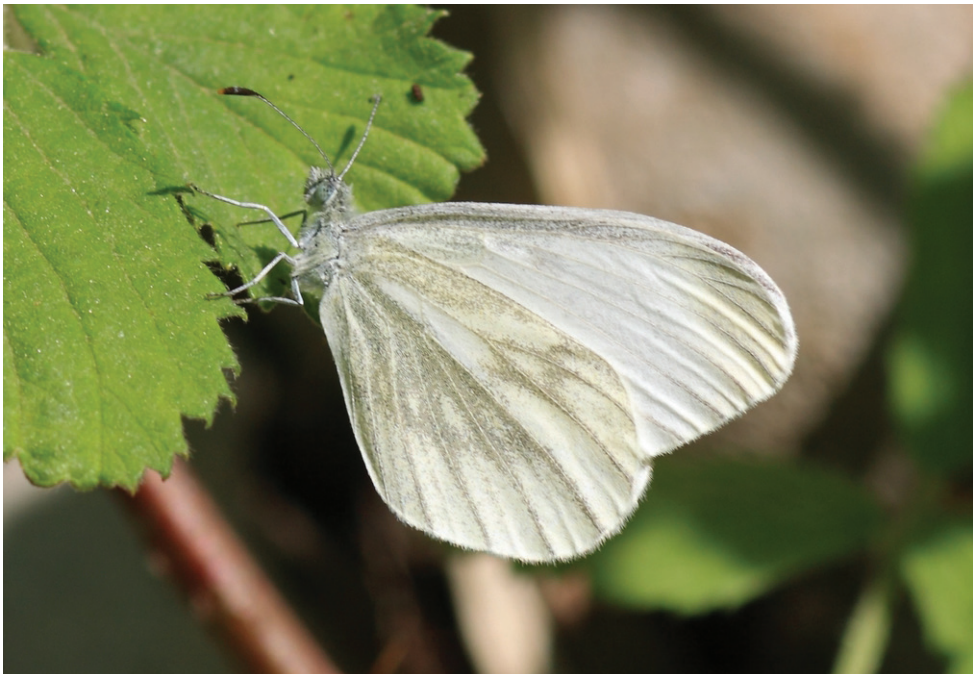
Leptidea morsei .