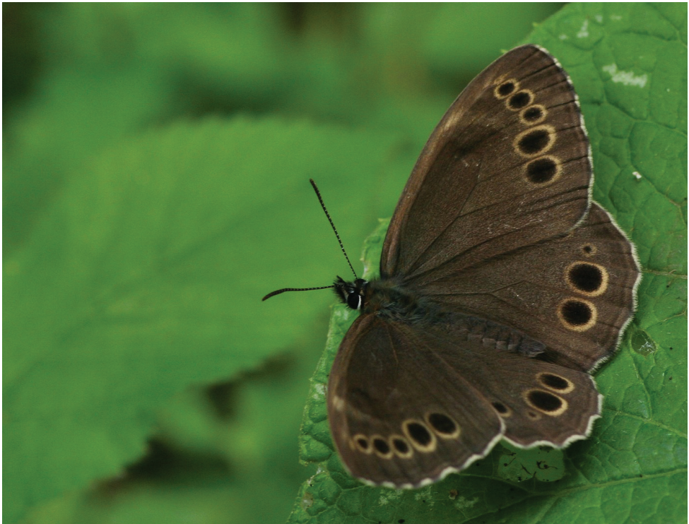
Lopinga achine .