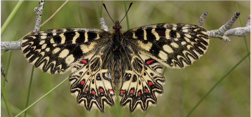
Zerynthia polyxena .

The species is listed on the Habitats Directive Annex 4 and Bern Convention Annex 2. This species occurs in a number of protected areas across its range. No specific conservation actions are needed at a European level, but in countries where the species is in decline important habitats should be protected and managed. The effects should be monitored by Butterfly Monitoring Schemes.