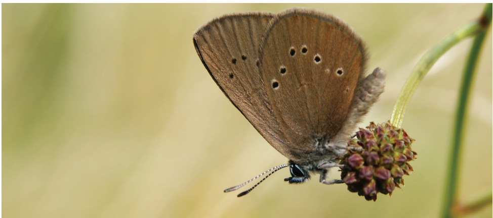
Phengaris nausithous . Photo Chris van Swaay.