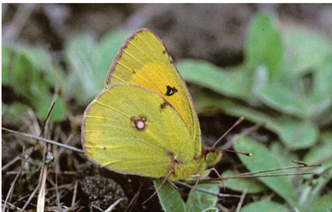
Colias myrmidone.