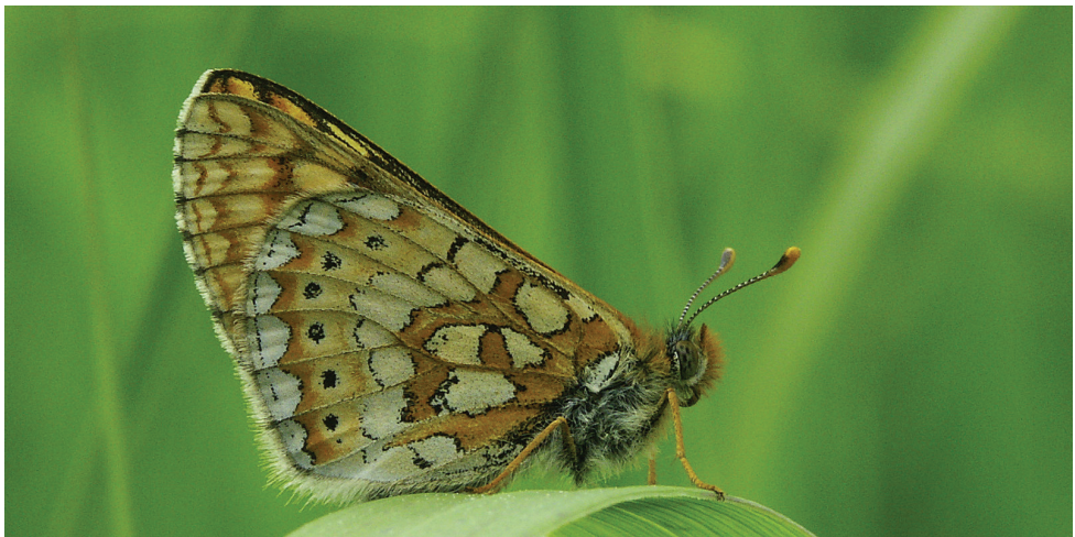
Euphydryas aurinia.

Although this species shows a decline in a part of its European range, it is not believed to face major threats at the European scale.