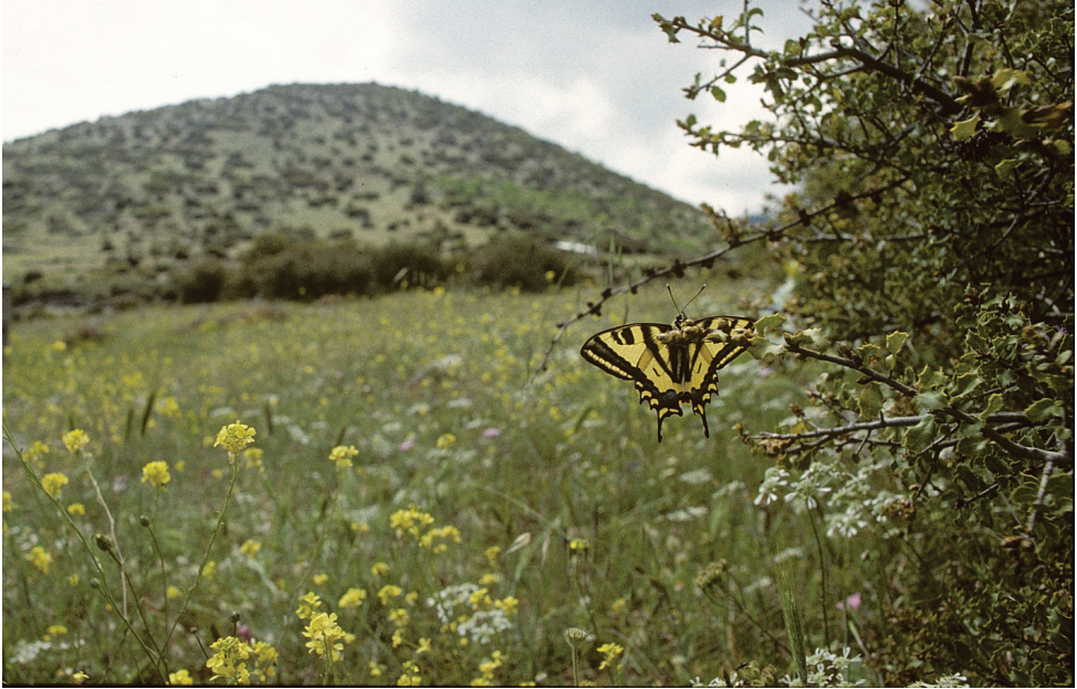
Papilio alexanor.