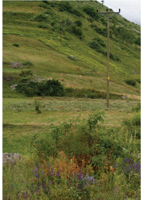
A mosaic of management combined with a flower rich road verge provides a wealth of butterflies.

Most woodland butterflies require some form of active management and this is essential for the survival of several threatened species. Management can either be regular thinning or rotational coppicing or planting. Some species also require the maintenance of open habitats within woodland, such as sunny clearings or paths/tracks. Traditional management is often a useful guide to suitable management, but may need to be adapted to suit modern timber markets. In Nordic countries as well as in many countries in Eastern Europe, woodland areas with plenty of wide open corridors with natural vegetation are important not for woodland species only, but are also inhabited by the majority of grassland species.