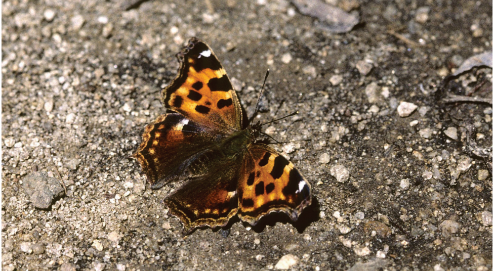
Nymphalis vaualbum .