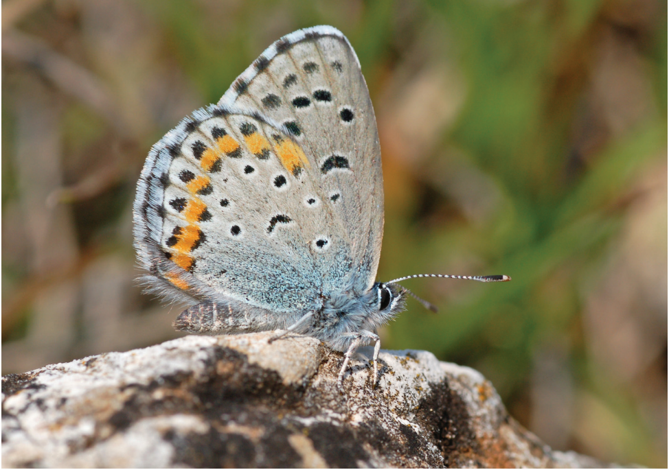
Pseudophilotes bavius .