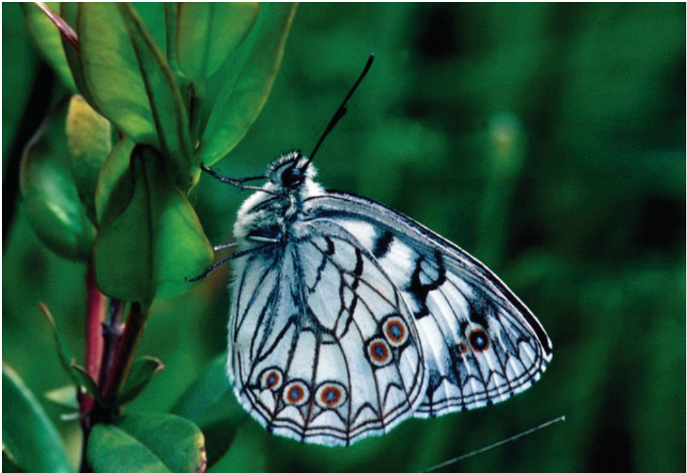
Melanargia arge .

Red List link: http://www.iucnredlist.org/apps/redlist/details/173235/0