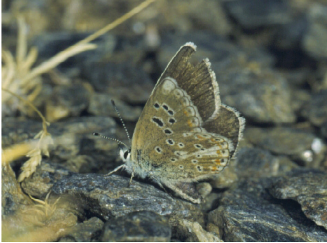
Polyommatus golgus .