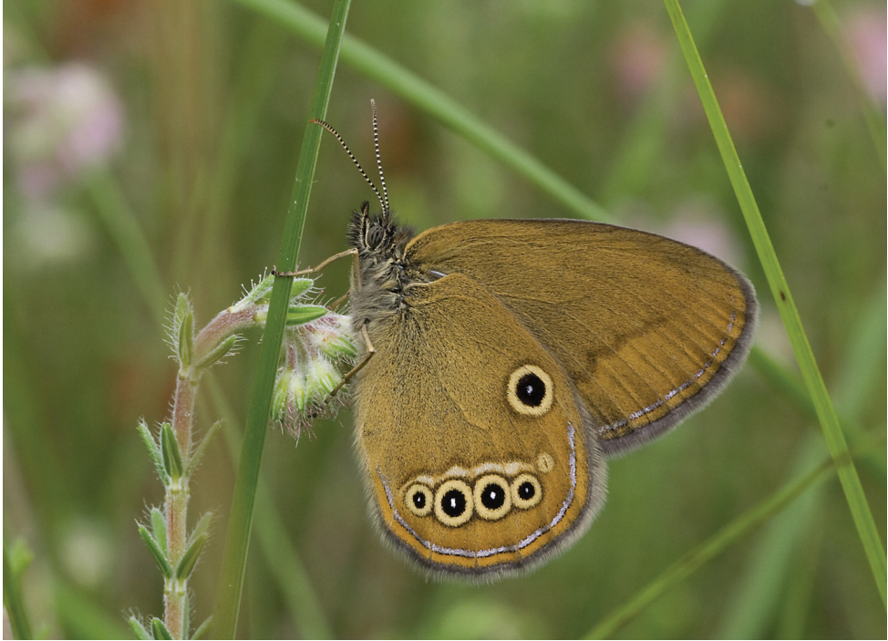
Coenonympha oedippus .

survives nowadays in small and fragmented habitats where colonies are threatened by isolation.