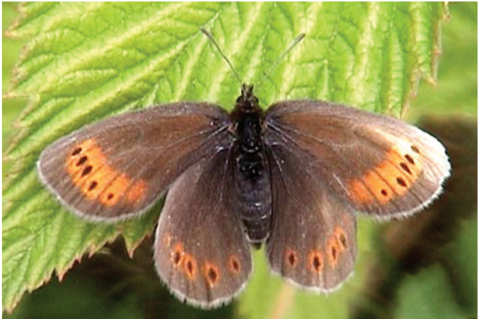
Erebia christi .