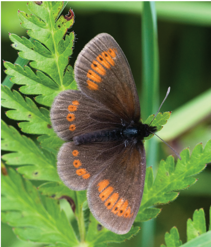
Erebia sudetica .

The species is listed on the Habitats Directive Annex 4 and Bern Convention Annex 2. More research is needed on the distribution and ecology of the species. Suitable