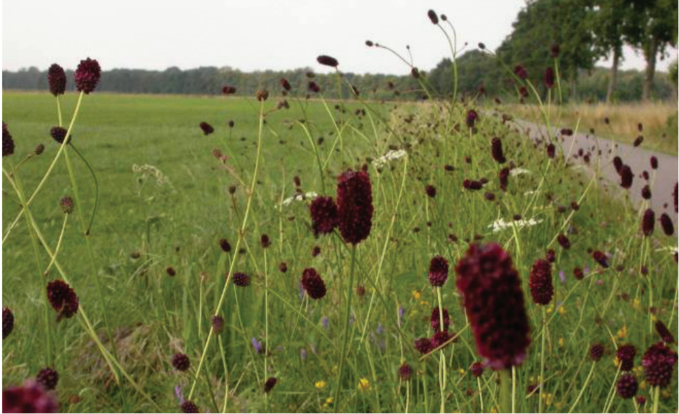
Habitat Phengaris nausithous , Netherlands.