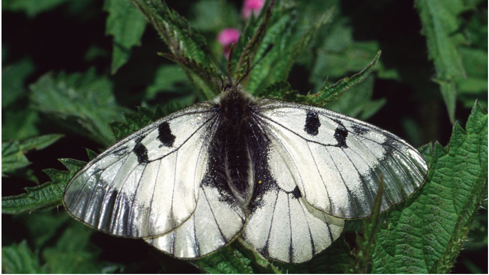
Parnassius mnemosyne . Photo: Kars Veling.

and managed. The effects of conservation actions should be monitored by a Butterfly Monitoring Scheme.