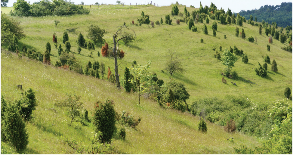
Habitat Phengaris arion , Eifel, Germany.

there as well. Habitats: dry calcareous grasslands and steppes (20%), dry siliceous grasslands (15%), mesophile grasslands (9%), coniferous woodland (7%), alpine and subalpine grasslands (7%), humid grasslands and tall herb communities (7%), heath and scrub (6%).