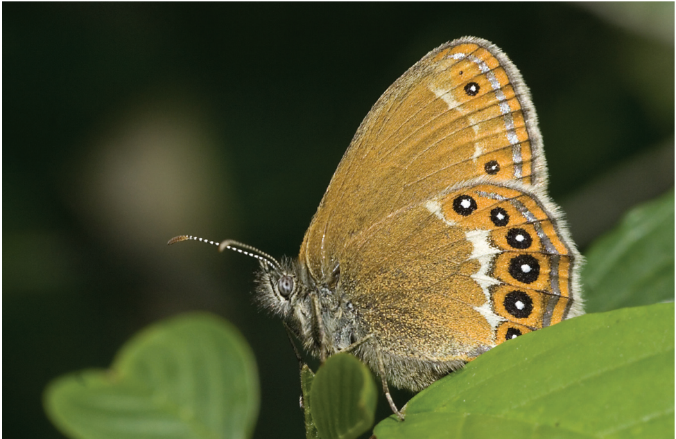
Coenonympha hero .

The Scarce Heath occurs in damp to wet grassy meadows in or at the edges of woods. Sometimes, they occur away from woods in drier places or in flower-rich grassland. The butterflies are fond of settling in grass and do not fly far, nor very often. Among the grasses they use as food are Tufted Hair-grass ( Deschampsia cespitosa ) and Bearded Couch ( Elymus caninus ). When half-grown, the caterpillar hibernates in a grass tussock, later also pupating there. This species has one generation a year. Habitats: humid grasslands and tall herb communities (26%), mixed woodland (19%), broad-leaved deciduous forests (14%), mesophile grasslands (9%), fens, transition mires and springs (7%).