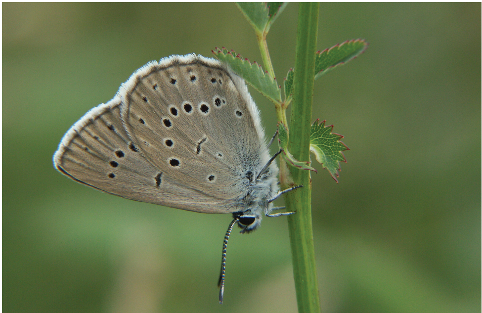
Phengaris teleius .