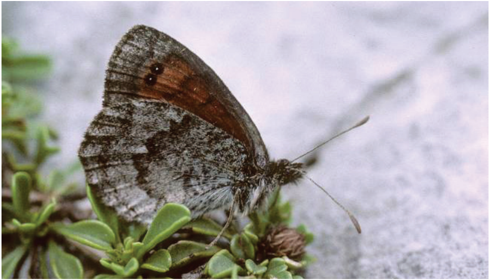
Erebia calcaria .

Red List link: http://www.iucnredlist.org/apps/redlist/details/173285/0