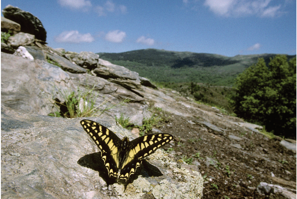
Papilio hospiton in its habitat.