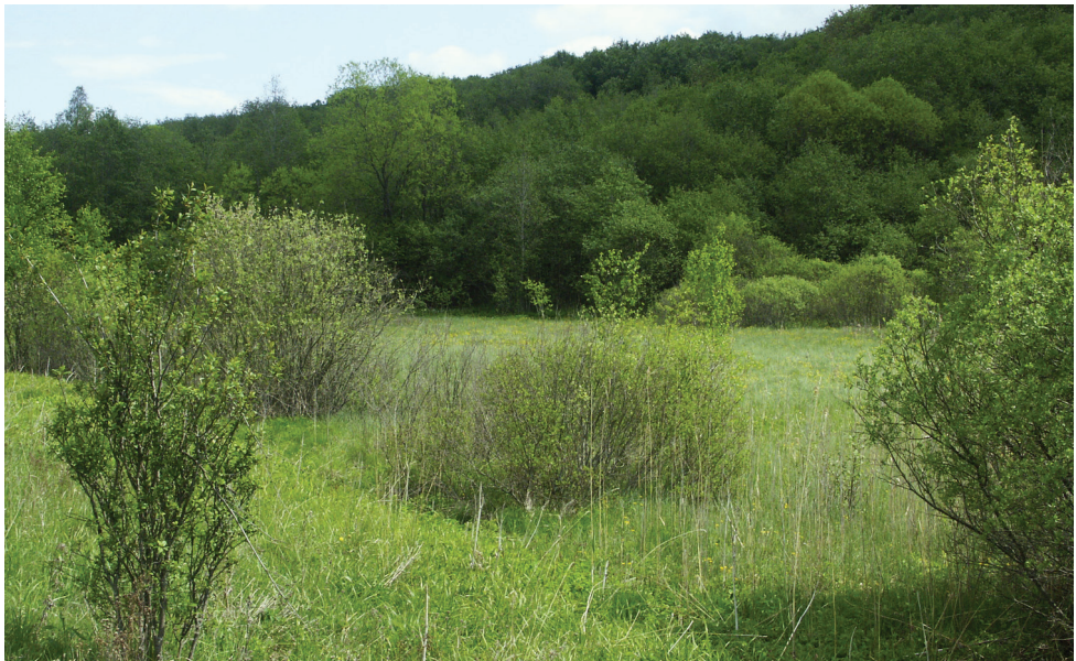
Habitat Euphydryas aurinia , Lithuania.

The Marsh Fritillary occurs in very different types of habitat, like moist, sheltered grasslands, along the edges of raised bogs and on dry, calcareous grasslands. The food-plants are Devil's-bit Scabious ( Succisa pratense ), Small Scabious ( Scabiosa columbaria ), Field Scabious ( Knautia arvensis ) and teasels ( Dipsacus spp.), on the Iberian peninsula Honeysuckle ( Lonicera spp.). The eggs are laid in large clumps under the leaves. The caterpillars spin a substantial nest between the leaves of the foodplants, feeding in it and also hibernating communally there. However, later they are solitary and look for places deep in the vegetation in which to pupate. The Marsh Fritillary has one genera-