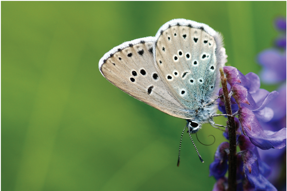
Phengaris arion .