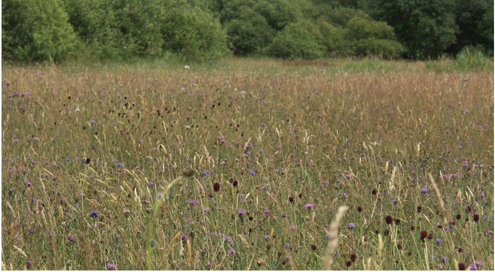
Habitat Phengaris teleius , Netherlands.

mesophile grasslands (16%), blanket bogs (12%), water-fringe vegetation (9%), fens, transition mires and springs (9%).