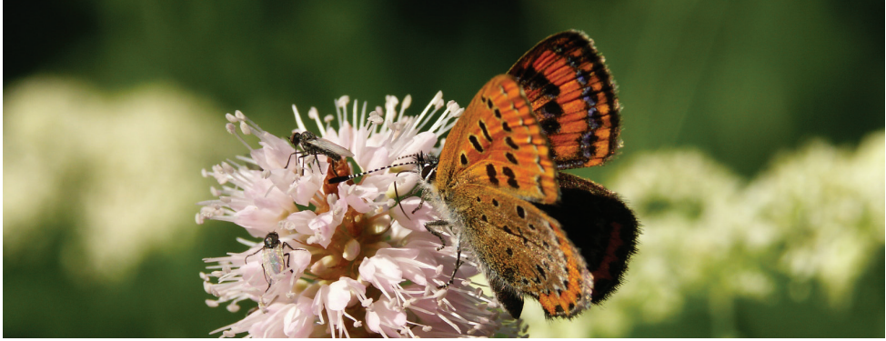
Lycaena helle.