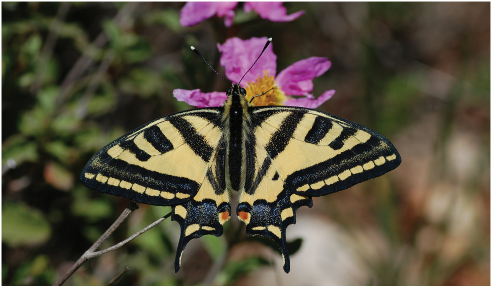
Papilio alexanor.

Although this species shows a decline in a part of its European range, it is not believed to face major threats at the European scale.