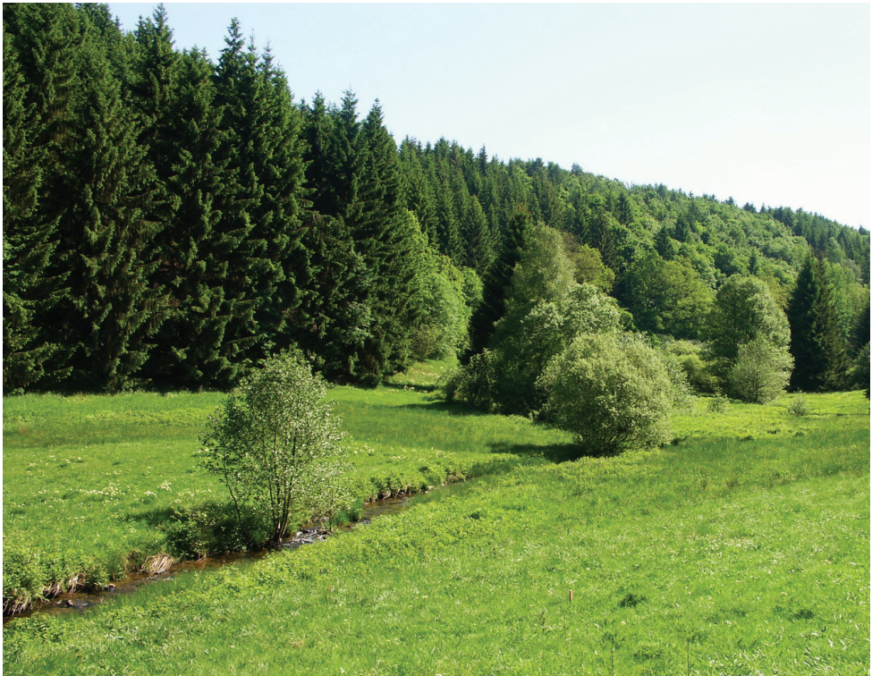
Habitat Lycaena helle , Eifel, Germany.

The Violet Copper is a rare butterfly that is often confined to very small sites, where it may be seen in large numbers. It is found in swampy, wet grassland with suf-